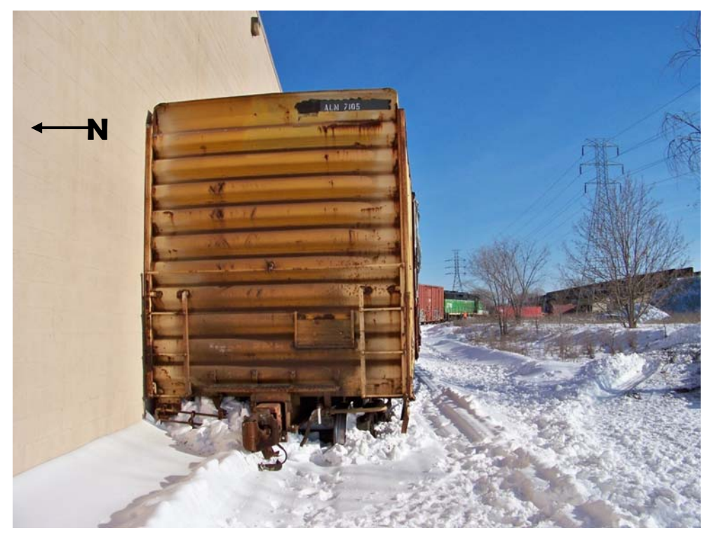
Figure 1. This photograph shows the final position of the boxcar on which the switch helper was riding. The photograph also shows the accumulation of snow.

As the foreman approached the railcars involved in the switching movement, he realized that the lead railcar (a boxcar) had pinned the switch helper against the building. The foreman said that the switch helper did not respond to his voice and there appeared to be no signs of life. He again radioed the yardmaster for emergency assistance.