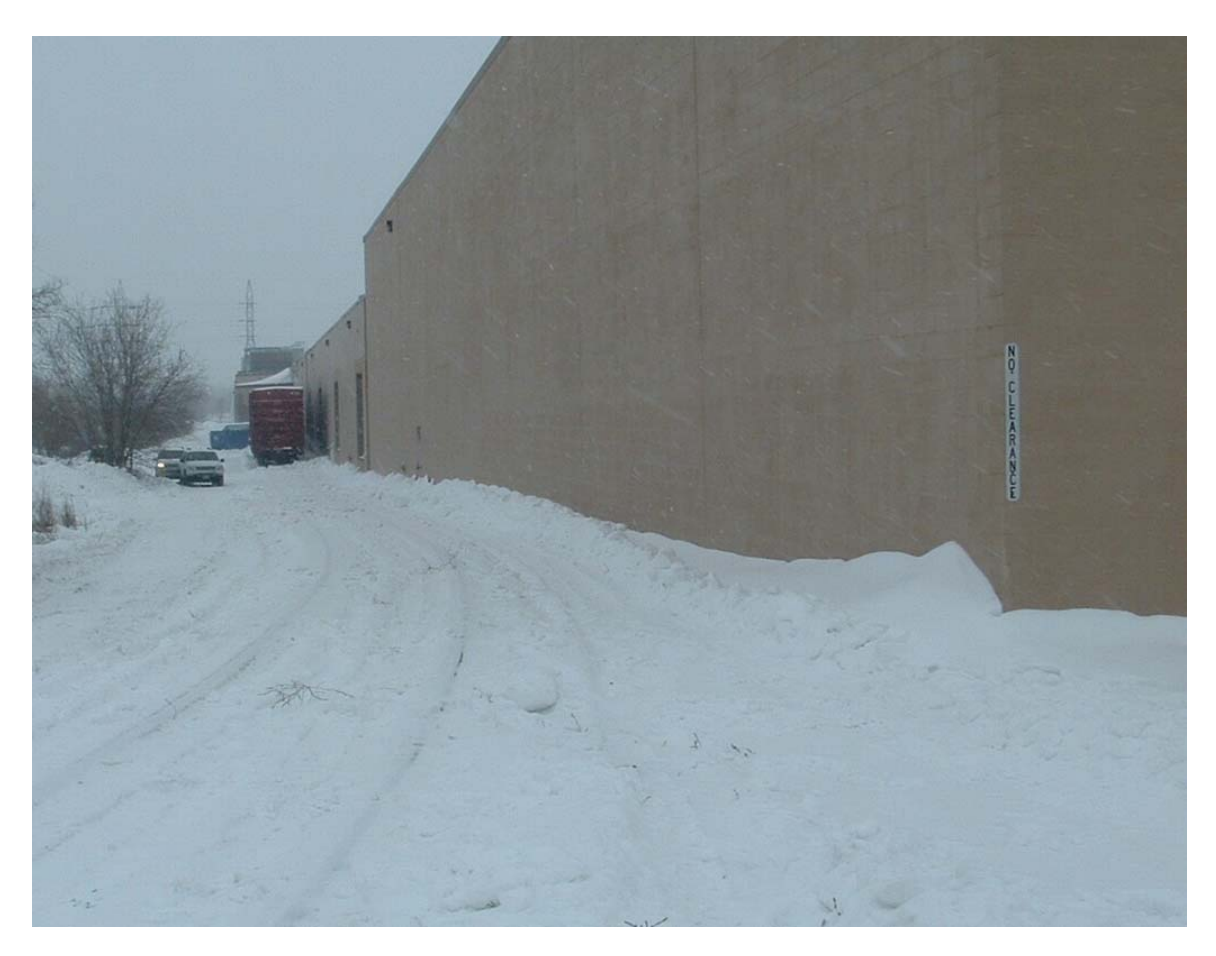
Figure 3. The "No Clearance" sign at Metro Hardwoods.