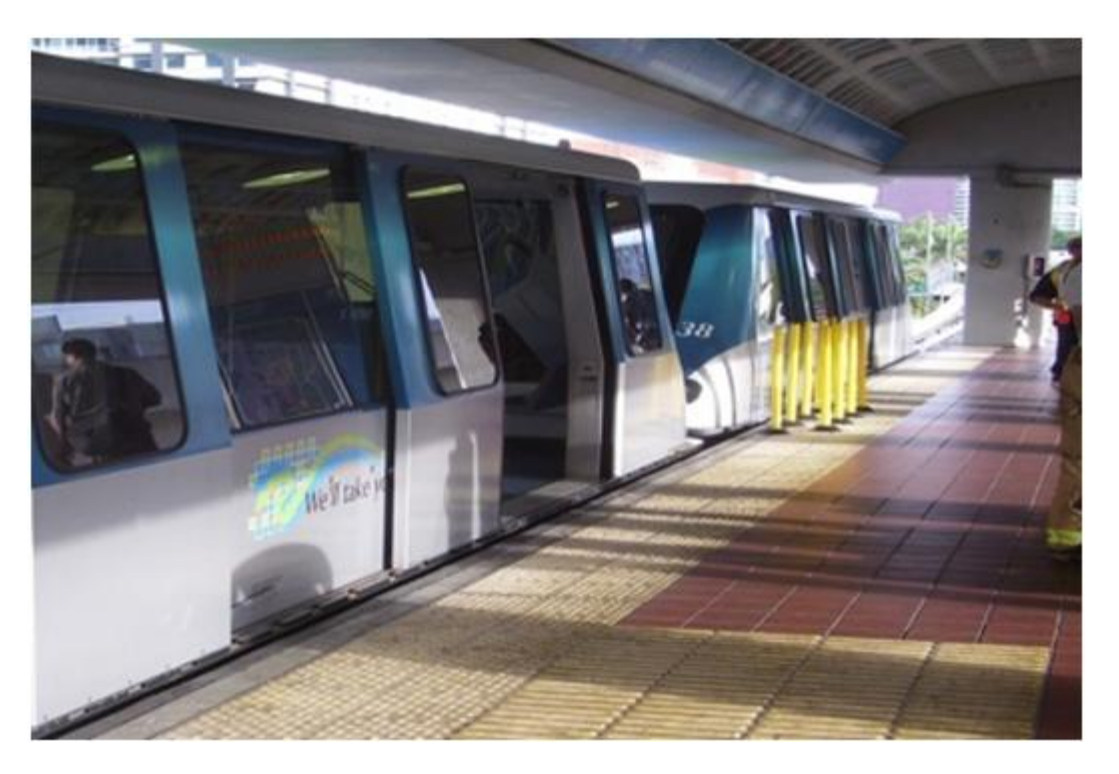
Figure 2. Photograph of Metromover No. 32 (lower left/foreground) and Metromover No. 38 (upper right/ background) at Brickell Station following the accident.

While the NTSB investigation found that Metromover No. 38 struck the trailing end of Metromover No. 32, it also determined that the accident actually resulted from a chain of events concerning two other Metromovers. The following information lists the four Metromovers involved in the investigation and briefly describes the role of each in the events leading up to the accident: