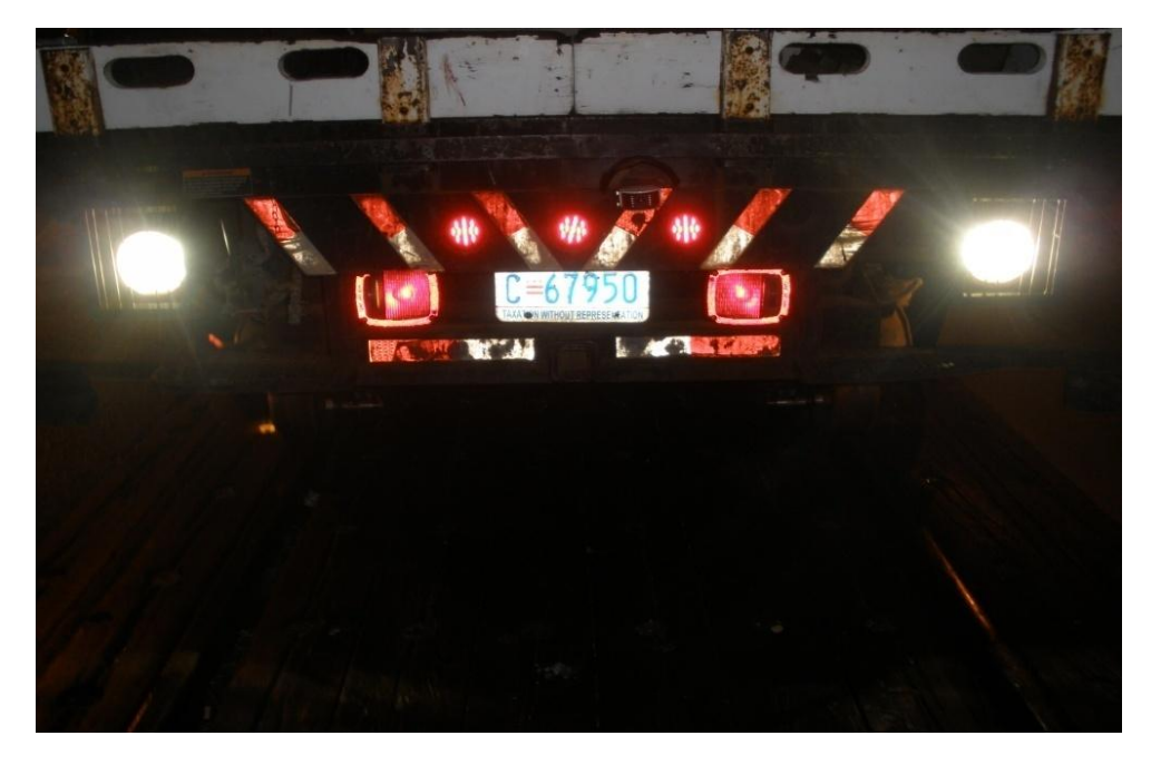
Figure 6. Rear view of a hi-rail vehicle with an upgraded lighting package.