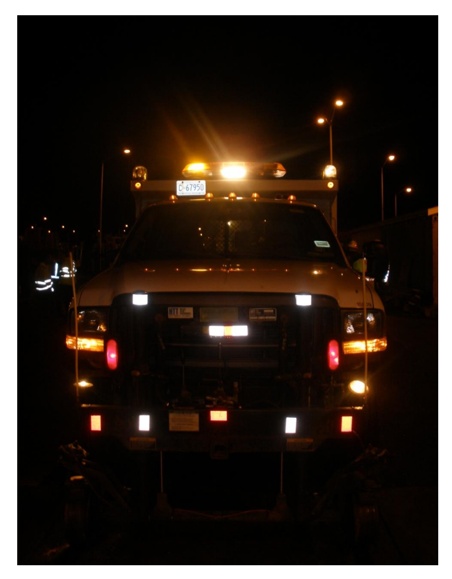
Figure 5. Front view of a hi-rail vehicle with the upgraded lighting package.

Currently, seven hi-rail vehicles have been retrofitted with the new lighting package. Nine other hi-rail vehicles are also slated to receive the upgraded lighting package. Priority for the lighting package upgrade will be based on need and the use of the hi-rail vehicle. The lighting package will include a backup camera and a dashboard-mounted internal monitor, upgraded lights, and shunt straps. (See figures 5, 6, and 7.) The approximate cost to upgrade the existing hi-rail equipment is $4,000 per vehicle.