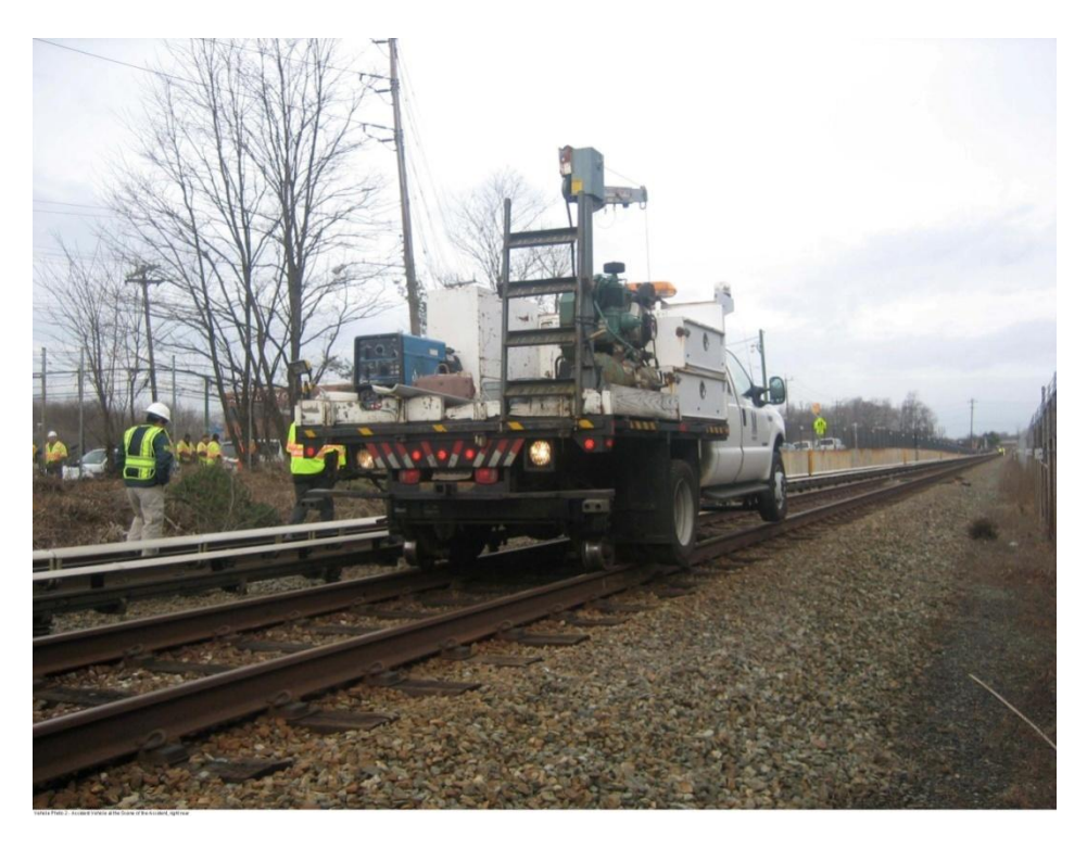
Figure 2. The striking hi-rail vehicle at the accident location.