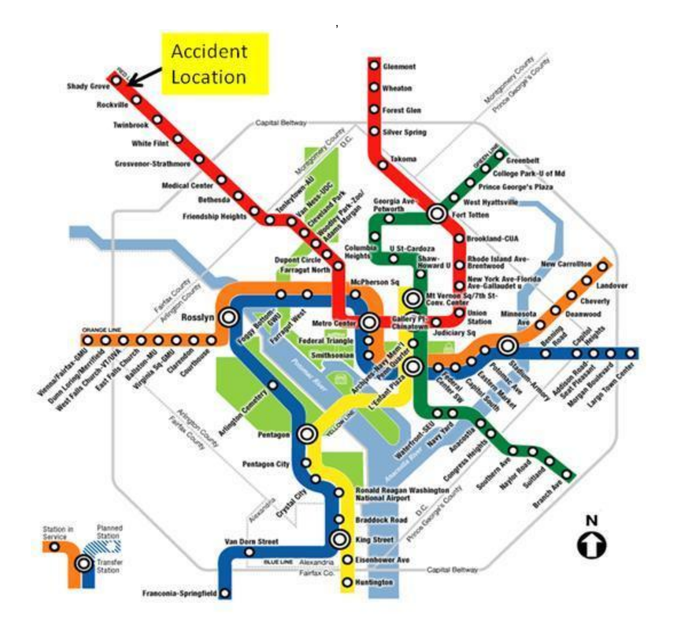
Figure 1. WMATA system track map, including the Red Line.