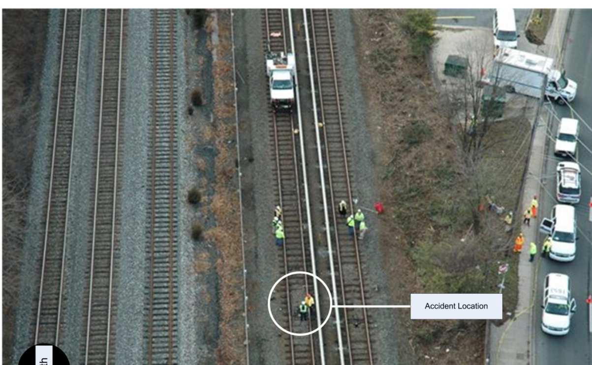
Figure 4. Aerial view of the accident location.