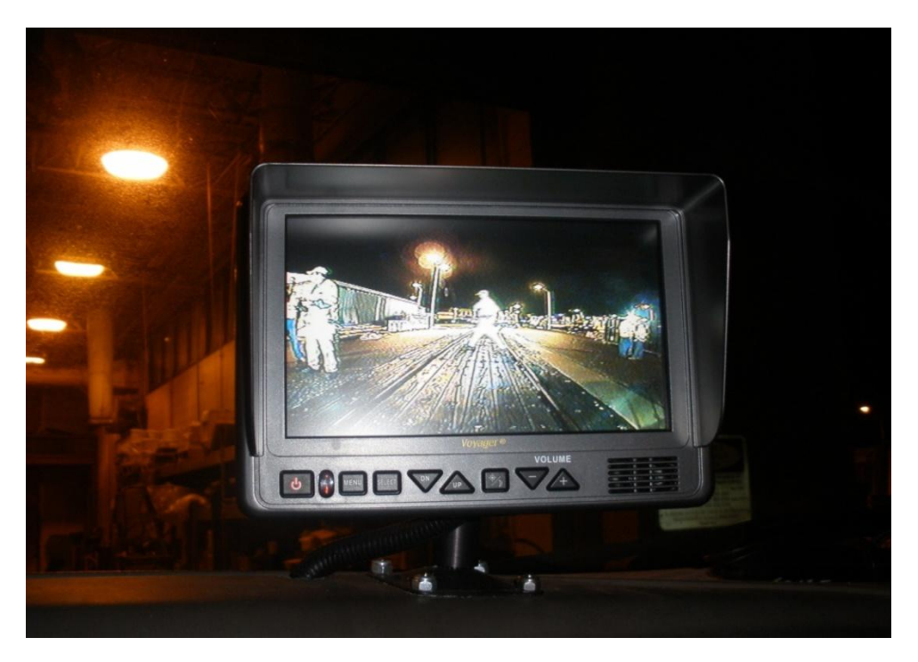
Figure 7. Video screen for backup movements in a hi-rail vehicle retrofitted with the upgraded lighting package.