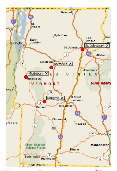
Map 1 – Focus Group Sites

Map 1 below shows the geographic distribution of the focus group sessions.