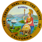
EDMUND G. BROWN JR. Governor