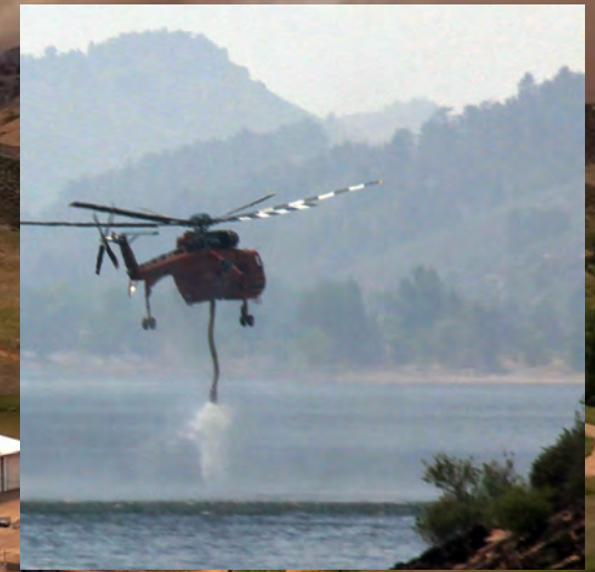
Horsetooth Reservoir provided a source of water for helicopters fighting the High Park Fire in Colorado.