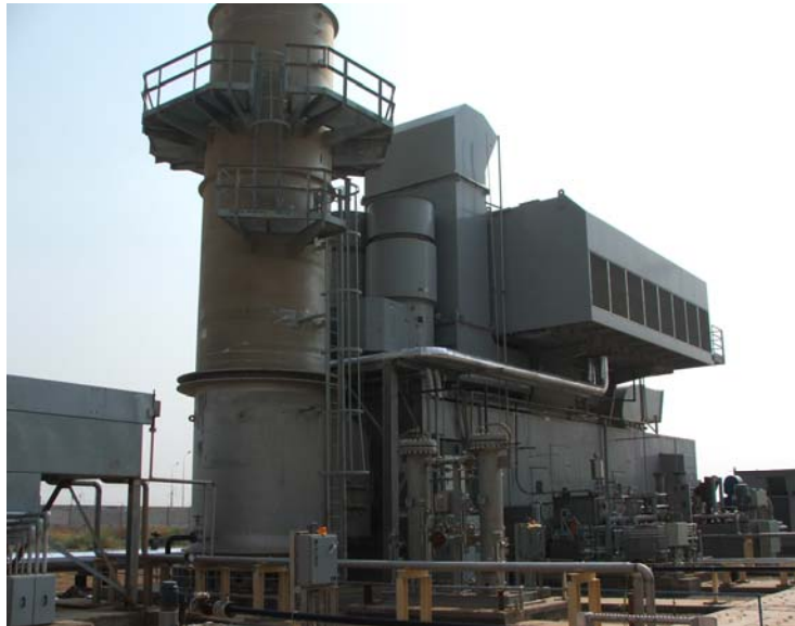
Site Photo 3. LM-6000 Unit at Qudas Power Plant

Frame 9E Units 3 and 4, and the four LM-6000 units at Qudas were originally installed under DFI funding through a USACE GRD administered contract with Fluor Intercontinental, Inc. However, subsequent to the demobilization of the contractor by USACE GRD, an inspection in January 2005 noted that only two of the Frame 9E units were operational and connected to the electrical grid. The four LM-6000's were not operational or producing electricity. At that January 2005 inspection, the inspection team noted that Frame 9E Units 1 and 2 were running on crude oil and producing 90-100 megawatts each. After the inspection revealed problems with Frame 9E Units 3 and 4, modification 01 to Task Order 0006 was issued on 19 January 2005 adding the inspection, evaluation, restoration, and start-up of these units to the scope of work for Task Order 0006, (Sub-contract Line Item Number 0001AF, Project Identification No. GBAKC 111).