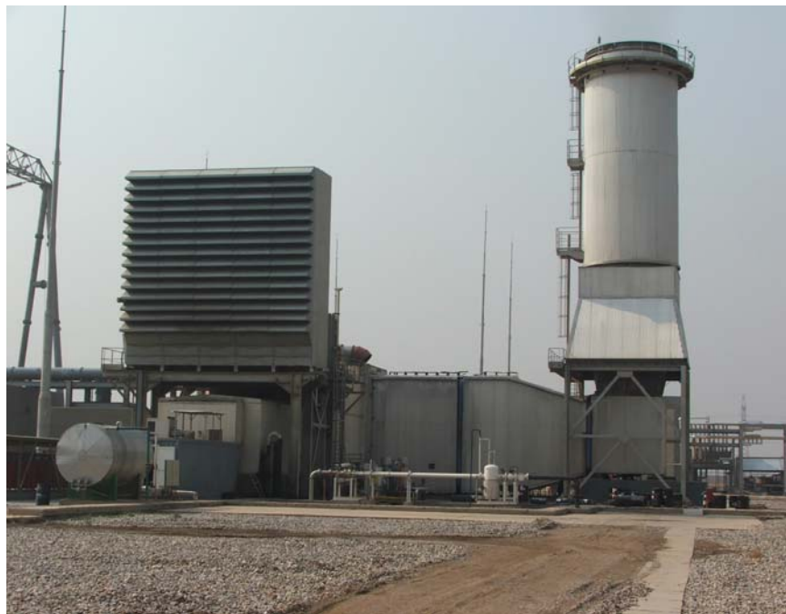
Site Photo 2. Frame 9E Unit at Qudas Power Plant

Each Frame 9E unit (Site Photo 2) has the capability to produce 123 megawatts of electricity. The Frame 9E units are designed to run on crude oil and diesel fuel oil (hereafter referred to as diesel). Each LM-6000 unit (Site Photo 3) has a rated capacity of 43 megawatts. The LM-6000 units are designed to run on diesel and natural gas. Electricity produced from all of the eight generators is connected to the MoE's 400kV electrical grid at the plant's switchyard.