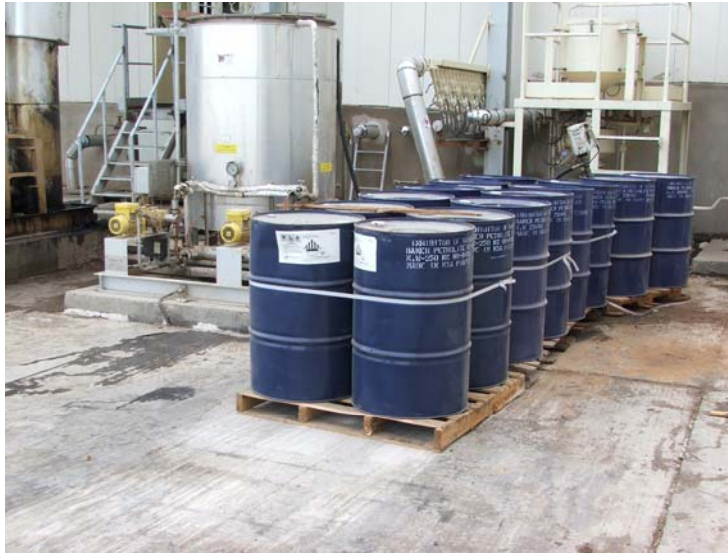
Site Photo 6. Vanadium Inhibitor Drums Adjacent to Frame 9E

The use of crude oil in the Frame 9Es increases the level and frequency of maintenance required. General Electric's publication titled "Heavy-duty Gas Turbine Operating and Maintenance Considerations" (2004), addresses the effects of fuel types burned in gas turbines. With heavier fuels such as crude oil, the operating time between major overhauls of the turbine's combustion unit is reduced by a factor of two to three as compared with natural gas. Although diesel is not as deleterious as crude oil, major overhauls of the combustion components are needed 1.5 times as frequently as with natural gas.