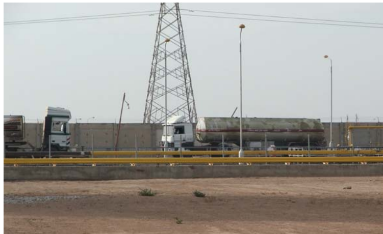
Site Photo 4. Diesel Trucks Delivering Fuel to Qudas Power Plant

Fuel Supply – According to a 22 April 2005 Defense Support Office report which evaluated Iraq's Electricity Sector, there is no national fuel strategy. Thus, refined fuel such as diesel is in short supply. Lack of refining capacity has limited the production of diesel in Iraq. The Ministry of Oil supplies the fuel used in Iraqi power plants. The Defense Support Office reports that the Ministry of Electricity is being supplied with about one third of its diesel needs. Further, at Qudas, the LM-6000s fuel supply is provided by trucks delivering diesel on a daily basis (Site Photo 4). There is no dedicated supply of fuel via pipeline for the LM-6000s.