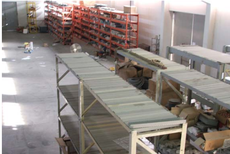
Site Photo 7. Spare Parts Storage