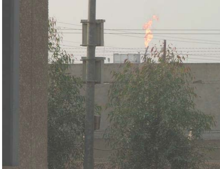
Site Photo 5. Natural Gas Flared at East Baghdad Facility in Vicinity of Qudas

requires FluorAMEC, LLC to assess this issue. The required assessment and ROM estimate will consider the feasibility and costs of redesigning and refurbishing the East Baghdad Gas Plant systems to provide 18 million standard cubic feet per day (MMSCF/D) of natural gas to Qudas. Each LM-6000 requires 9 MMSCF/D to operate; therefore, the natural gas obtained from the East Baghdad facility could supply the daily fuel requirements for two of the four LM-6000s. FluorAMEC's assessment shows that, for an investment of approximately $45 million, recovered natural gas from East Baghdad could be utilized as the fuel source for two LM-6000 Units.