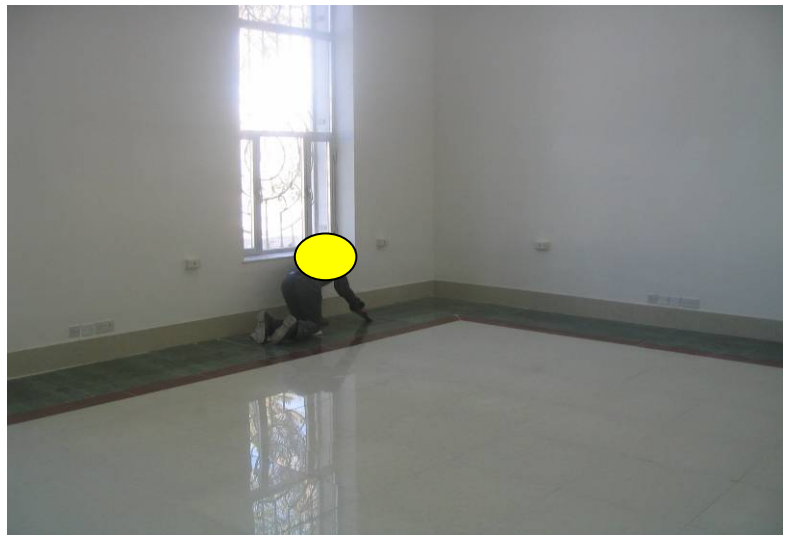
Site Photos 17 and 18. Quality workmanship done to the interior of the MOD HQ building