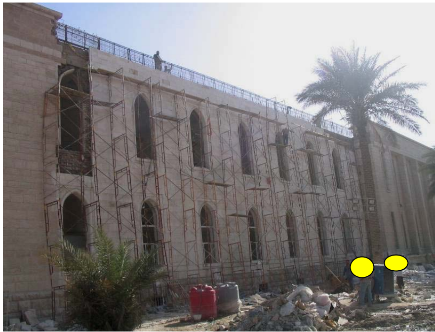
Site Photo 9. Near completion of the left wing of the MOD HQ building