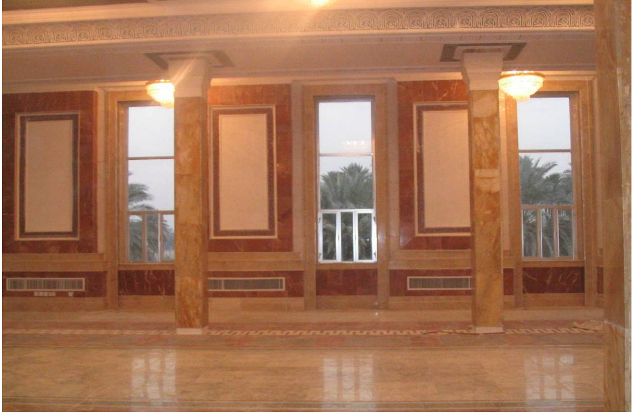
Site Photo 16. A finished interior ballroom within the MOD HQ building

According to the contractor and MOD officials, the current usage of the building far exceeds the original intent of providing working space for approximately 450 MOD personnel. It is currently estimated that more than 3,000 MOD personnel now work in the MOD HQ building on a daily basis. However, accommodations for the additional MOD personnel were made without major disturbance to the contractor's work. For example, large ballrooms were turned into office space through the use of cubicles (Site Photo 22).