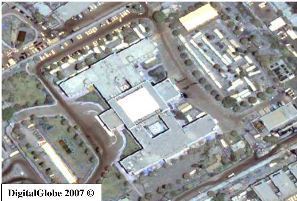
Aerial Image 1. Aerial view of MOD HQ complex

The renovation project was intended to provide working space for approximately 450 MOD personnel. The facility was occupied by MOD personnel during our site assessment.