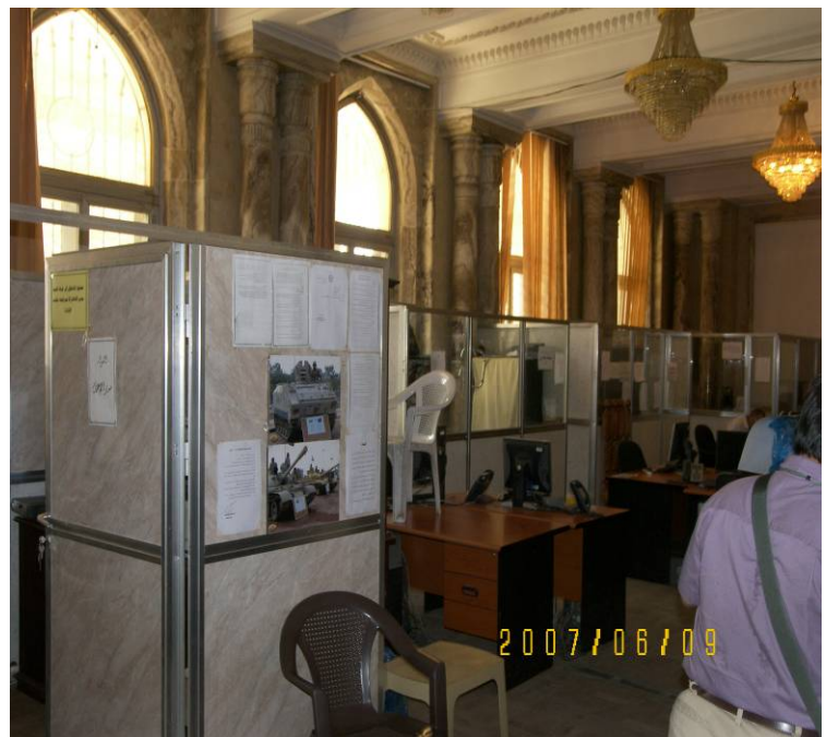
Site Photo 22. Interior ballroom turned into additional office space through the use of cubicles