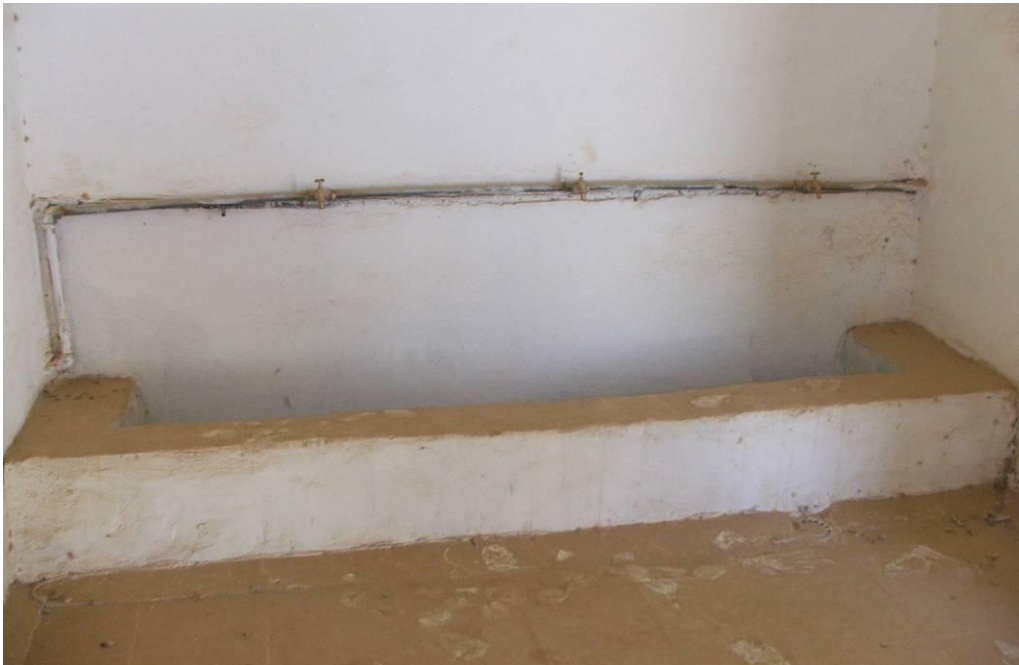
Site Photo 17. Feet washing bench within the students' outside bathroom facility

The outside bathroom facility consisted of eastern-style toilets, a sink, and a concrete bench to wash feet (Site Photo 17). This facility was more difficult to assess because of a significant amount of dirt throughout (Site Photo 18). Some of the toilets were clogged with debris from a lack of routine maintenance.