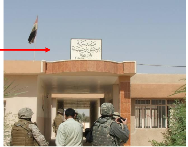
Site Photo 1. Entrance to the Al Shurhabil School