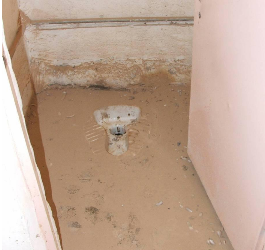
Site Photo 18. Evidence of no routine maintenance performed - excessive amount of dirt within the bathroom facility