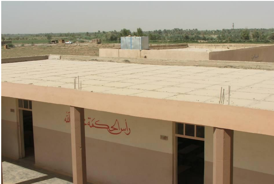
Site Photo 8. Condition of the roof tiles after renovation

During the site visit, SIGIR observed the construction of the new classroom buildings. The roof tiles appeared to be in good condition throughout the expanse of the roof (Site Photo 8). There were drainage holes at the roof's edges, which will allow water to drain from the roof. The exterior and interior walls appeared to be adequately repaired/replaced (Site Photos 9 and 10). The majority of the interior tile and concrete floor work was good; however, there were areas of missing and broken tiles, as well as, uneven floors (Site Photo 11).