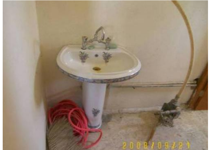
Site Photos 15 and 16. Eastern-style toilet and sink in the inside bathroom facility

The outside bathroom facility consisted of eastern-style toilets, a sink, and a concrete bench to wash feet (Site Photo 17). This facility was more difficult to assess because of a significant amount of dirt throughout (Site Photo 18). Some of the toilets were clogged with debris from a lack of routine maintenance.