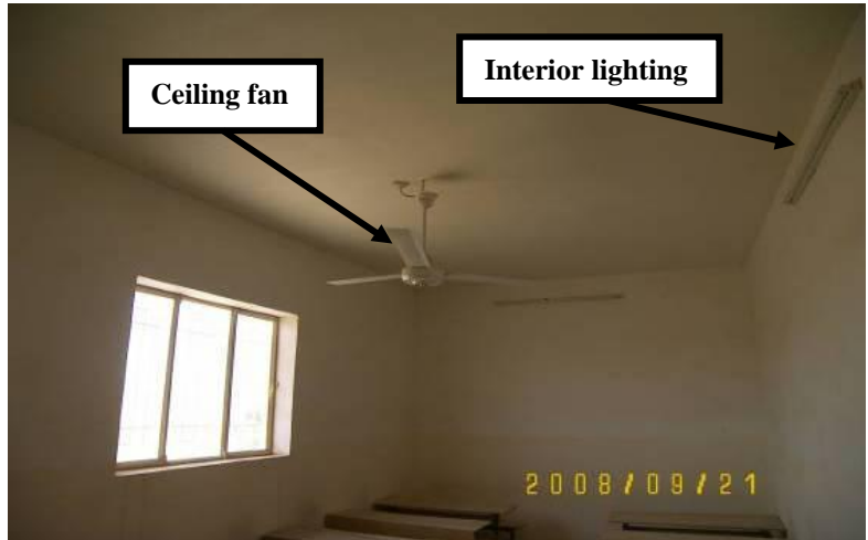
Site Photo 13. Newly installed ceiling fan and interior lighting