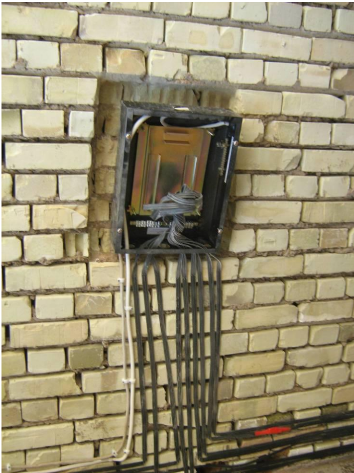
Site Photo 6. Installation of electrical wiring

Site Photos 6 and 7 document the installation of electrical wiring within the main circuit board and general building construction.