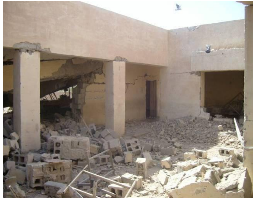
Site Photos 2 and 3. Condition of the Al Shurhabil School prior to refurbishment