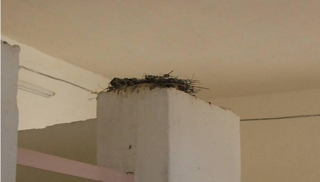
Site Photo 19. Further proof of no routine maintenance – a large bird’s nest within the students’ bathroom facility