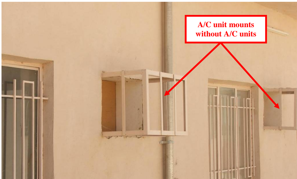
Site Photo 14. Properly installed A/C mounts; however, no A/C units