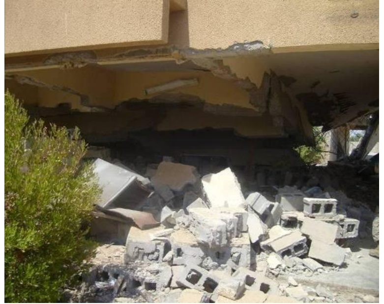
Site Photos 4 and 5. Condition of the Al Shurhabil School prior to refurbishment