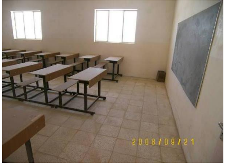
Site Photos 9 and 10. Adequately repaired exterior and interior school building walls