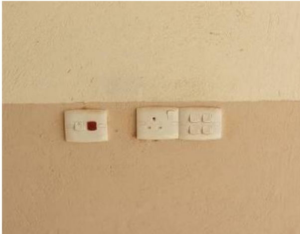
Site Photo 12. Installed light switches

During the site visit, SIGIR did not detect any instances of potentially harmful electrical system tampering.