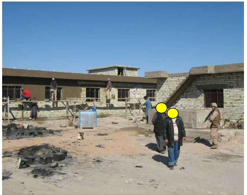
Site Photo 7. Ongoing general construction