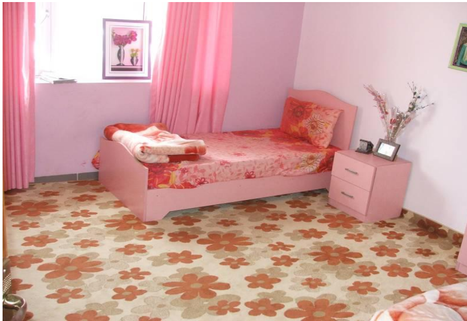
Site Photo 13. Female residential house bedroom

The utilities for the children's residential houses were functioning at the time of the site assessment. The ambient temperature was low enough that the air conditioning was not in use; however, the room ceiling fans were operating.