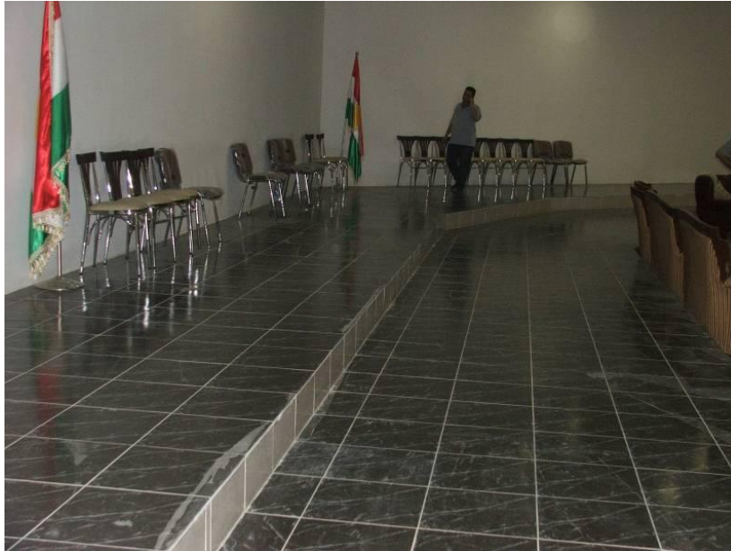
Site Photo 8. Multi-purpose building auditorium

The cafeteria incorporates a floor to ceiling glass exterior wall as an architectural feature that permits ambient light and creates a pleasant atmosphere in the cafeteria (Site Photo 9). The cafeteria was finished with plaster walls and ceramic tile flooring. The placement and quality of the tile was similar to the construction seen in the auditorium. The cafeteria was furnished by MOSA with commercial grade furniture.