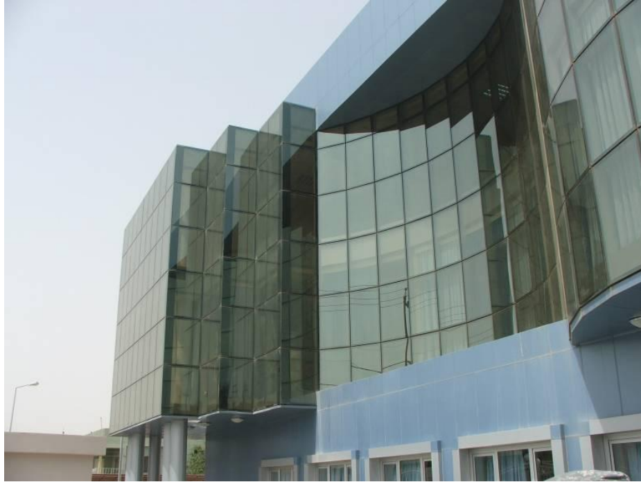
Site Photo 4. Exterior view of administration building

The construction was reinforced concrete beams and floor slabs with what are assumed to be reinforced concrete columns covered with stainless steel. The structure was configured to cantilever 5 from the interior column line over the rotunda floor.