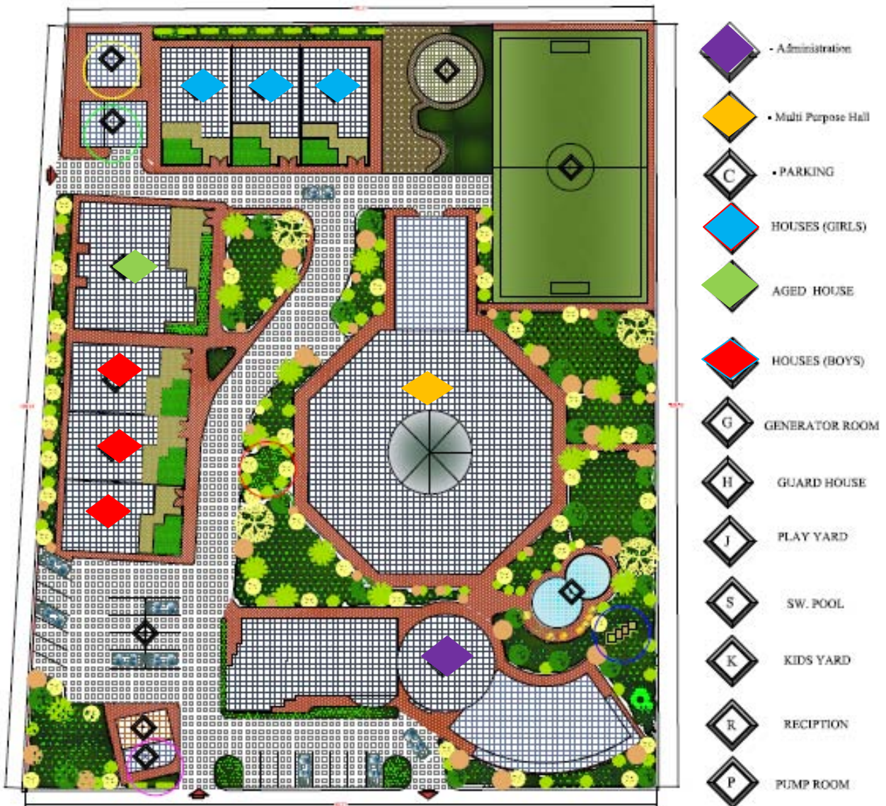
Figure 1. General site plan

The contractor-furnished site plan appeared well-planned and maximized the use of the limited space available. Landscaping and walkways were indicated on the site plan; the walkways provided good internal circulation around the buildings, and the landscape provided a buffer from the main and side streets, allowing the residents some privacy.