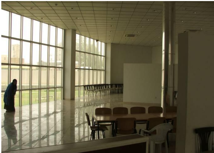
Site Photo 9. Multi-purpose building cafeteria

A single-story kitchen was annexed to the multi-purpose building. The kitchen consisted of commercial grade appliances, which included large gas cooking surfaces and deep fryers with stainless steel ventilation hoods (Site Photo 10). At the time of the site assessment, cafeteria personnel were preparing the noon meal.