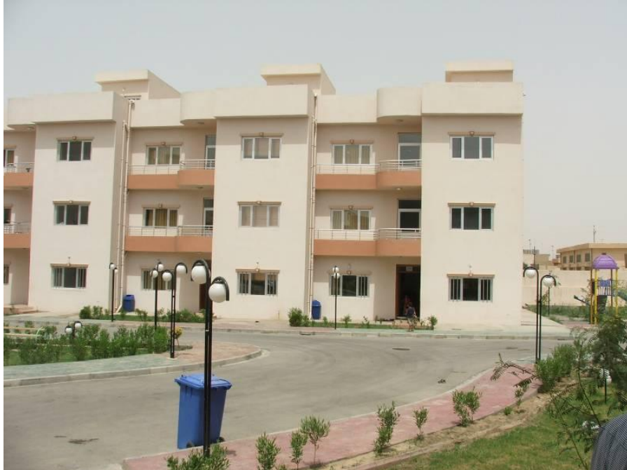
Site Photo 11. Exterior view of residential house for boys