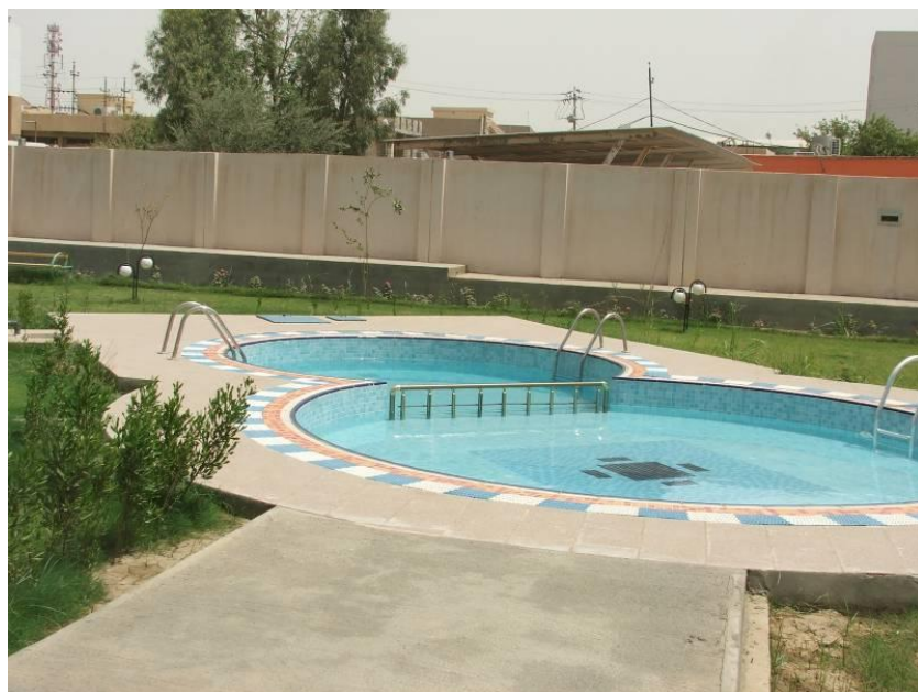
Site Photo 17. Swimming pool