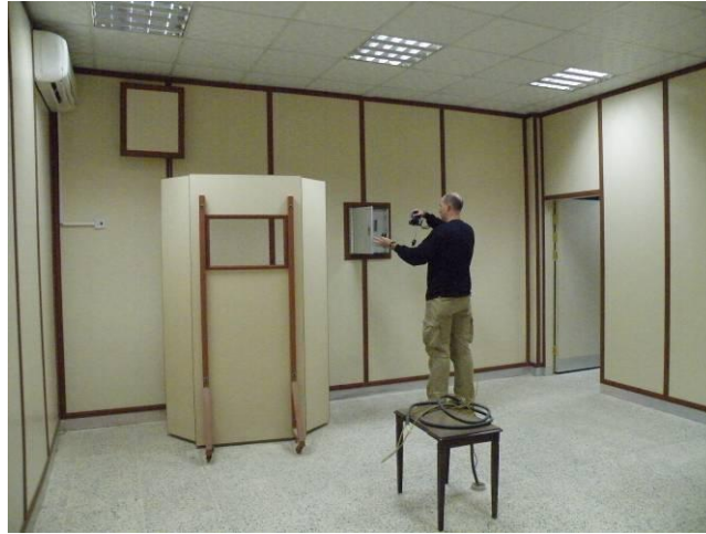
Site Photo 14. X-ray room

The diagnostic facilities and pharmacy are located on the lower level. The diagnostic facilities included an X-ray room, darkroom, and medical laboratory. The X-ray room appeared finished, but was lacking X-ray equipment. The local national project engineer stated that the X-ray equipment was awaiting transfer to the health center. The contractor installed a moveable barrier to protect the X-ray technician and extended the electrical line through the floor to be connected to the X-ray equipment (Site Photo 14). The pharmacy appeared secure, stocked, and able to dispense medication. The supplies were neatly organized on shelves.