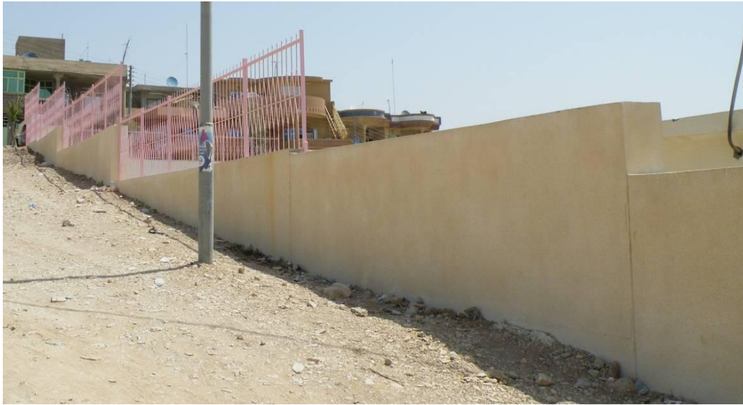
Site Photo 5. Security fence atop perimeter wall

(Site Photo 5). The security wall appeared to be constructed plumb and level, and was stepped to accommodate the steep grade. The wall appeared sound with no apparent cracking or settlement. Three entry points to the facility were constructed with locking steel gates placed at each opening.