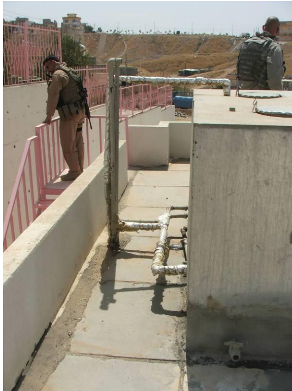
Site Photo 16. Roof tank and piping

Piping to the tanks appeared to consist of PVC with fiberglass insulating wrap. A GRN KAO representative informed SIGIR that the winter temperatures can fall below freezing, and bursting pipes was an issue on other projects in the region. The insulation on the pipes will provide some measure of protection against freezing. However, since the tank is not insulated, freezing could occur near the various apertures and cause pipe breakage at the tank/pipe interface.