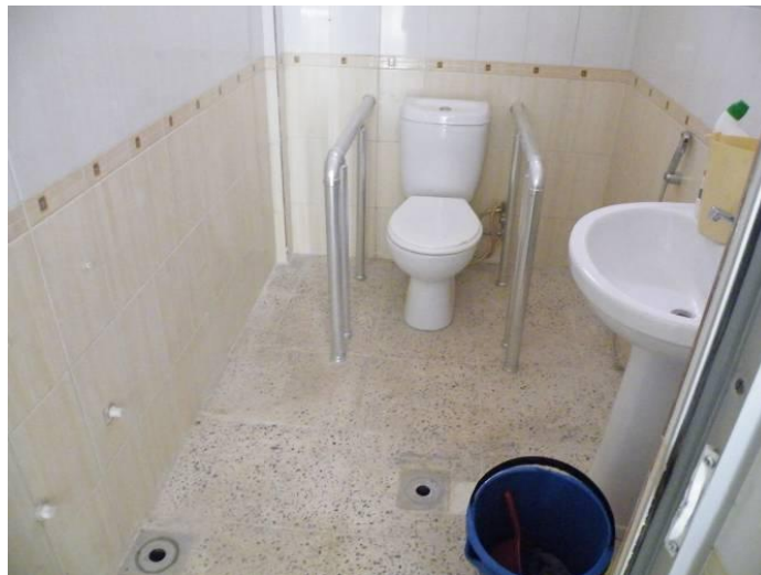
Site Photo 10. Accessible restroom

The upper level contained both conventional and physically-challenged accessible restrooms. The restrooms' construction quality appeared good with no cracked, loose, or missing tile (Site Photo 10). All fixtures and grab bars were firmly attached to the structure. At the time of the site assessment, the restrooms were functioning and relatively clean.