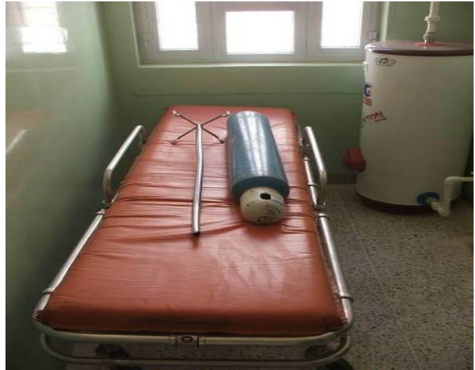
Site Photo 12. Accessible pressurized gas cylinder storage

The contractor constructed reinforced concrete stairs to connect the upper and lower levels (Site Photo 13). The steps appeared to be level and even with consistent risers and tread widths. No apparent cracks or signs of settlement or distress were observed. Handrails were not present in the stairway. Handrails could prevent injury in the event of individuals tripping or losing their footing on the steps.