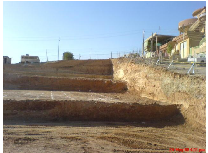
Site Photo 2. Site layout before modification (Courtesy of GRN) Site Photo 3. Site after excavation (Courtesy of GRN)