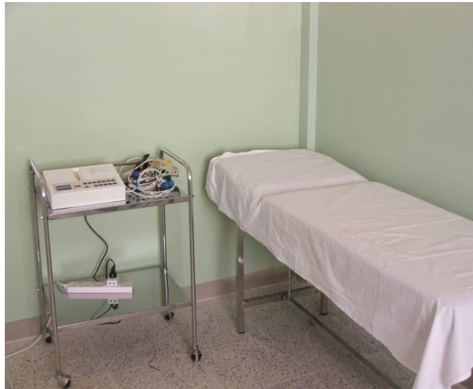
Site Photo 9. Patient exam room

Patient exam rooms are located on the upper level of the facility (Site Photo 9). The contractor provided some furniture for the exam rooms and the Ministry of Health provided the medical equipment.