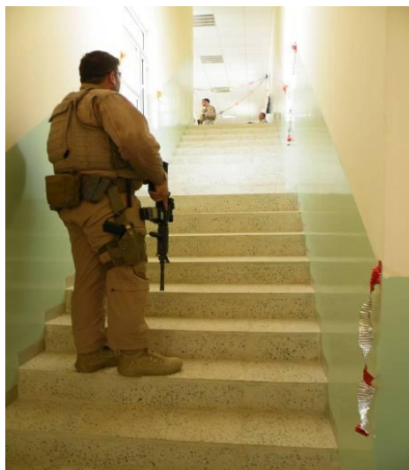
Site Photo 13. Interior stairs connecting upper and lower levels

The contractor constructed reinforced concrete stairs to connect the upper and lower levels (Site Photo 13). The steps appeared to be level and even with consistent risers and tread widths. No apparent cracks or signs of settlement or distress were observed. Handrails were not present in the stairway. Handrails could prevent injury in the event of individuals tripping or losing their footing on the steps.