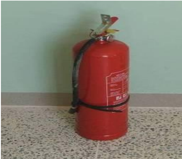
Site Photo 11. Fire extinguisher on main hallway floor

The SIGIR inspection team noted that a pressurized gas cylinder was on a gurney in one of the hallways (Site Photo 12). The cylinder was accessible to the public and was susceptible to tampering. Pressurized gas cylinders should be secured to prevent accidents.