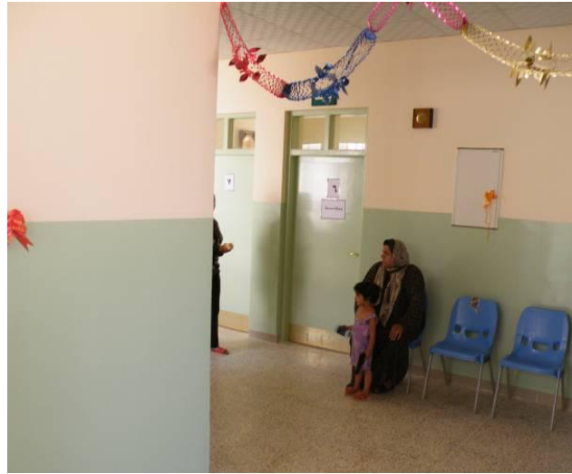
Site Photo 7. Patient waiting area

included as part of the contract. The health center was open at the time of the site visit and several patients were waiting to be seen by the attending physicians.