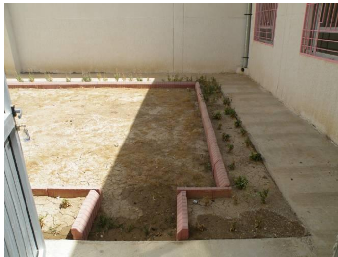
Site Photo 15. Interior courtyard

The geometry of the facility created a small outside area at the elevation of the lower level that was made into a courtyard and contained a perimeter sidewalk with interior plantings. Runoff from a portion of the roof was discharged into the interior plantings to promote plant growth and groundwater recharge (Site Photo 15).