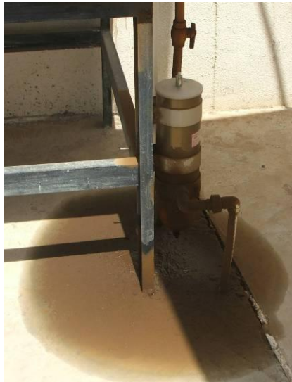
Site Photo 17. Fuel leak at the side of tank

Power was distributed throughout the building using several distribution panels. SIGIR inspectors opened several of the panels and noted that all covers were in place and circuits appeared adequately labeled.