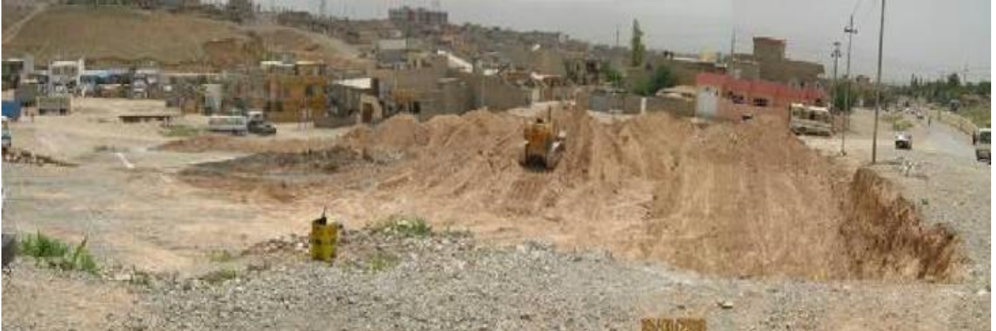
Site Photo 1. Initial excavation of project site

with GRN Kirkuk Area Office (KAO) personnel. The project site was vacant land, located in a residential area of Sulaymaniyah (Site Photo 1). The project terrain is relatively steep with a uniform slope from the primary access road at the higher end of the project site to a minor access drive at the lower end of the project site. During the site assessment, the GRN KAO local national engineer stated that the facility serves a population of 60,000 people from the surrounding area.