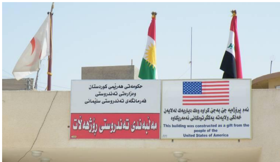
Site Photo 6. Entrance sign

The facility contained three entry points, a primary entry point to the upper level with a secondary entry at the generator's location, and an auxiliary entry point at the lower level. The upper level entry is the primary entrance for patients and is identified with signs, and included a sign indicating the U.S. government's involvement with the project (Site Photo 6).