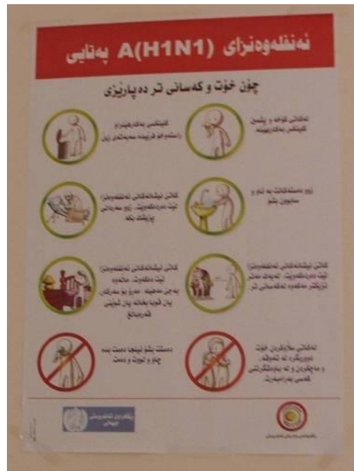
Site Photo 8. Health education poster in Humer Kwer Health Center

Educational posters were placed throughout the facility to promote awareness of public health issues (Site Photo 8).