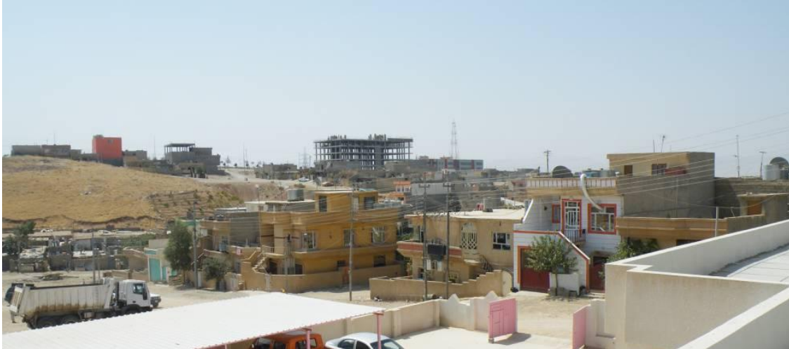
Site Photo 4. Surrounding residential development

The Humer Kwer Health Center project is located in a recently developed section of Sulaymaniyah. The general topography of the area is moderately steep with the majority of new residential development occurring on the hillsides surrounding the city center (Site Photo 4). Public utilities were available at the project site and included potable water, sanitary sewer, and electricity.