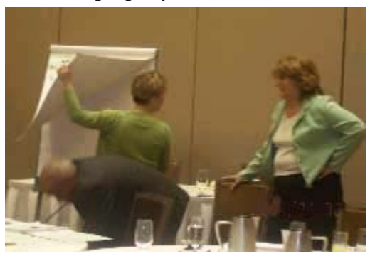
A Team Presentation of Strategies