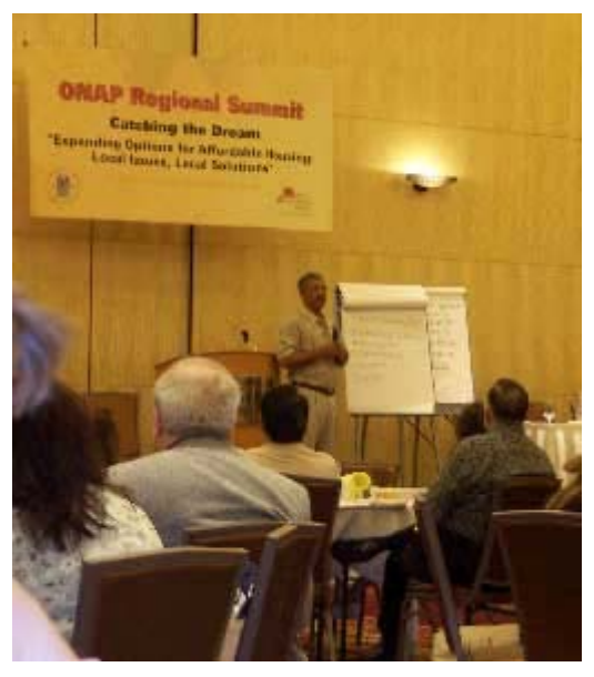
Presentation of Action Plans