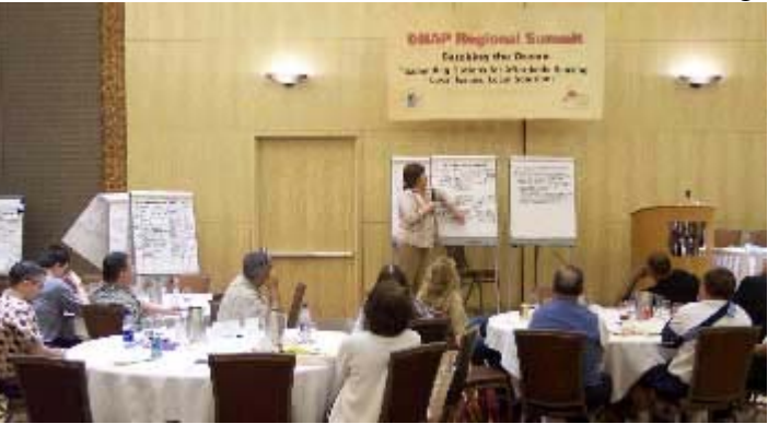
A Team Presentation of Action Plans

2. Current resources are grossly inadequate. The Team indicated that, while some of the required data are missing or incomplete, it is clear that the current and projected needs for safe and affordable housing greatly exceed the combined resources available from HUD and other sources.