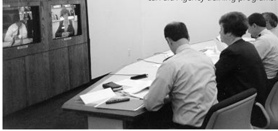
Region I conference participants Interact with their counterparts via video link.

AFB, Texas; and Langley AFB, Va. As with any new technology, video participants were apprehensive at first. The mood changed, however, as the conference got underway, leading to a lively exchange of ideas from participants in Marietta and from around the Region. Judging from the outcome, this will not be the last instance where interactive technology can aid Agency training programs.