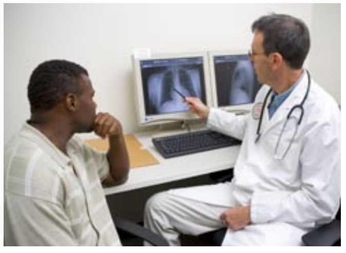
A chest x-ray may show if you have TB disease.