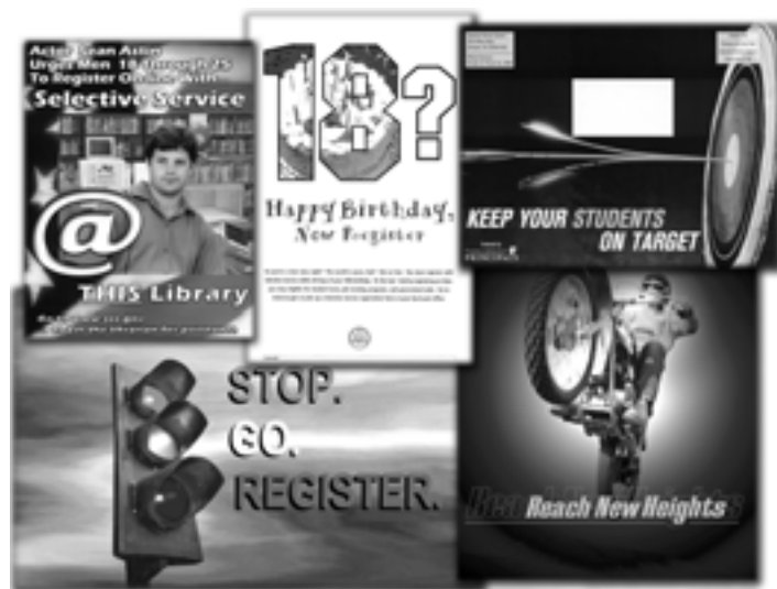
Collage of materials included in high school kits.

During the five-day event, the SSS asked registrars, teachers and others who touch young men's lives to support the national registration drive by taking part in various activities. Some of the activities planned by the schools included Internet Registration Day, playing of the Agency produced high school video featuring Lou Holtz, Head Football Coach at the University of South Carolina, and lessons about the SSS and the registration requirement using the Agency's Teacher's Guide. SSS