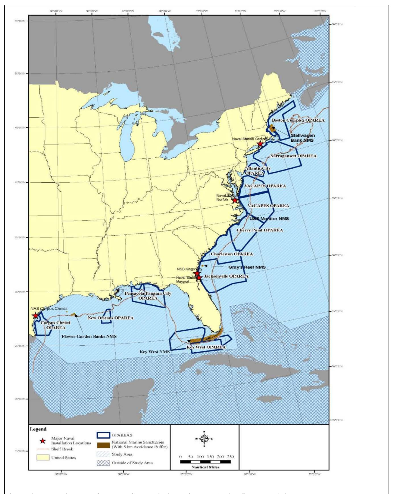
Figure 2. The action area for the U.S. Navy's Atlantic Fleet Active Sonar Training.