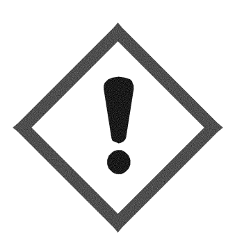
Figure C.2 – Exclamation Mark Pictogram

C.2.3.3 Where a pictogram required by the Department of Transportation under Title 49 of the Code of Federal Regulations appears on a shipped container, the pictogram specified in C.4 for the same hazard shall not appear.