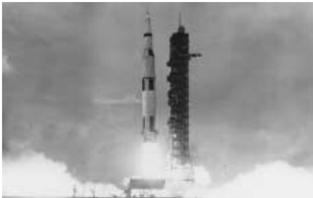
The Saturn V, the largest rocket the United States had ever developed, was designed to send men to the Moon.

December 21: The National Aeronautics and Space Administration launched Apollo 8 atop a Saturn V booster from Cape Kennedy, Florida. The astronauts aboard included Col. Frank Borman and Col. William A. Anders, USAF, and Capt. James A. Lovell, Jr., United States Navy. A few days later, the three men achieved the first lunar orbit.