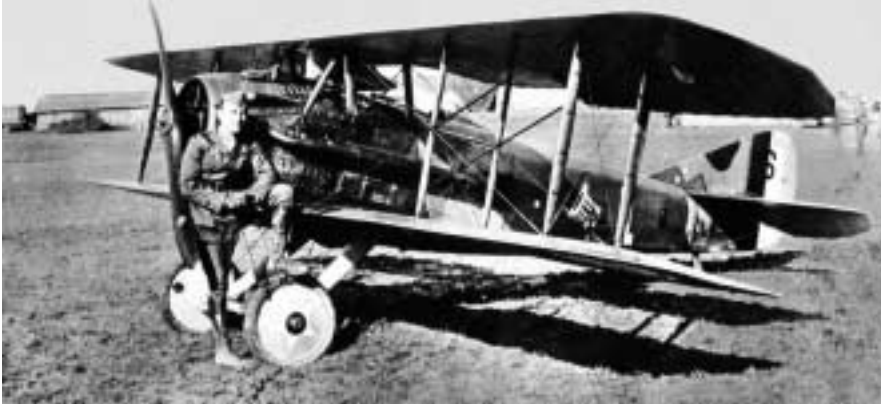
Capt. Edward V. Rickenbacker and a Spad 13