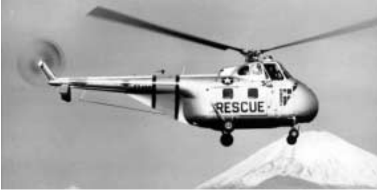
The Air Force rescued 116 U.S. servicemen from behind enemy lines in Korea using the H-19 Chickasaw, first flown in 1949.

April 18: From Holloman Air Force Base, New Mexico, an Aerobee research rocket carried the first primate, a monkey, into space.