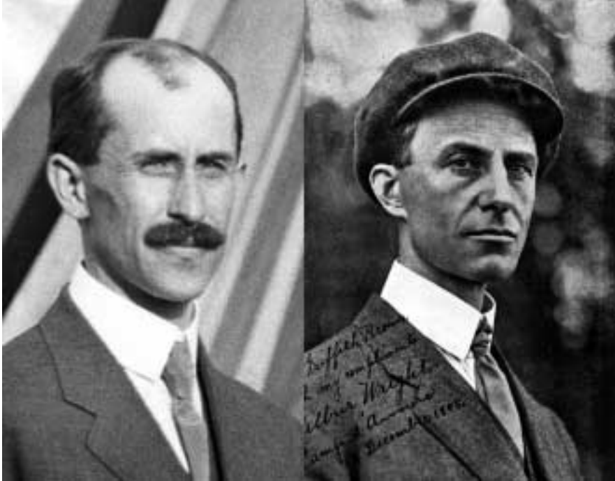
Orville and Wilbur Wright. They took turns flying the first successful airplane.