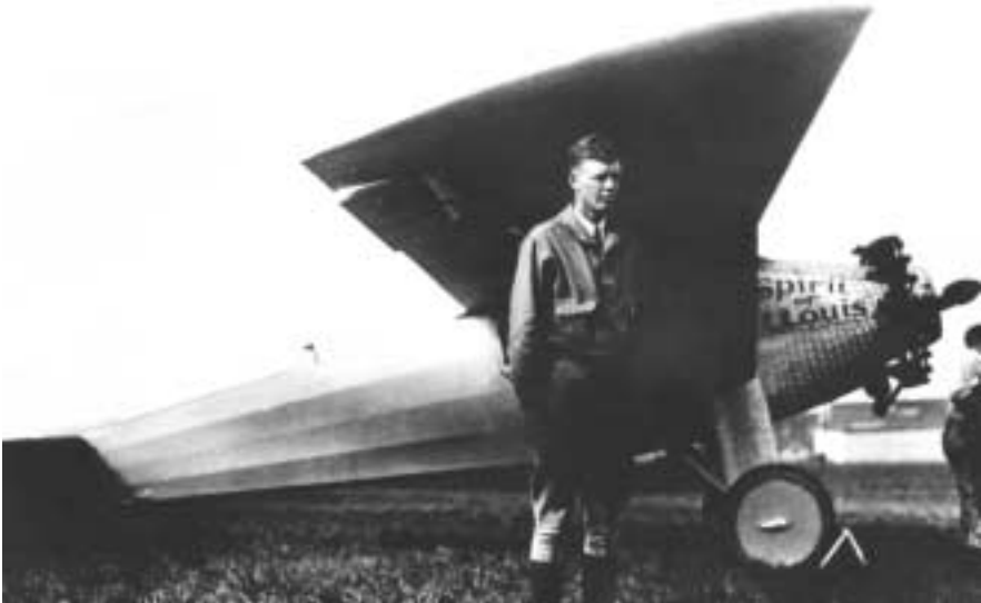
Charles Lindbergh and the Spirit of St. Louis

May 21: In his airplane Spirit of St. Louis , Charles A. Lindbergh, a captain in the Missouri National Guard's 110th Observation Squadron, completed the first solo nonstop flight across the Atlantic Ocean, from New York to Paris, a distance of 3,610 miles, in 33 hours and 39 minutes. By act of Congress, Lindbergh received the Medal of Honor for this flight.