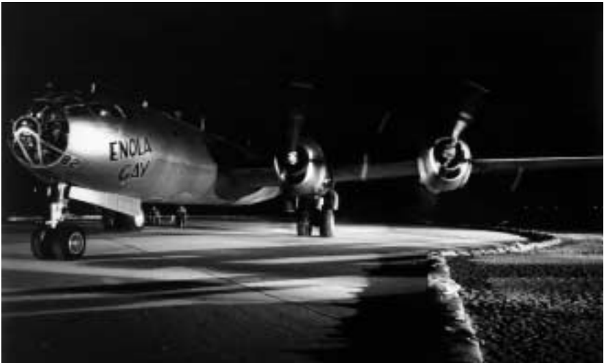
Boeing B-29 Superfortresses dropped atomic bombs on Hiroshima and Nagasaki, Japan.

August 9: Three days after the destruction of Hiroshima, Maj. Charles W. Sweeney and his crew, flying a B-29 called Bock's Car , bombed Nagasaki in the second and last atomic bomb attack, which largely destroyed the city and killed at least 35,000 people.