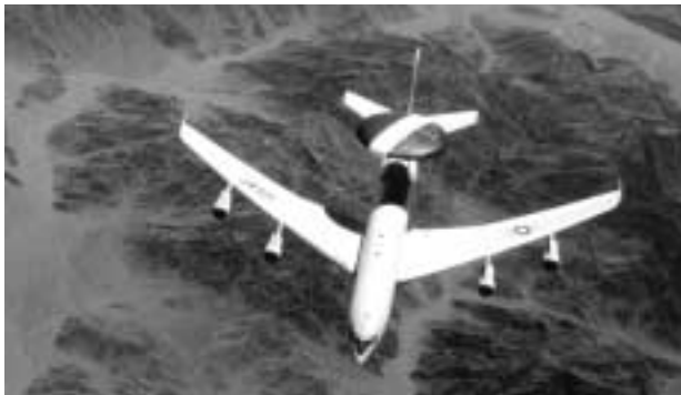
The E-3 Sentry provides all-weather surveillance, command, control, and communications.

March 9: In Operation FLYING STAR, two E-3 airborne warning and control system aircraft deployed to Saudi Arabia in response to a threat on the country's southern border.