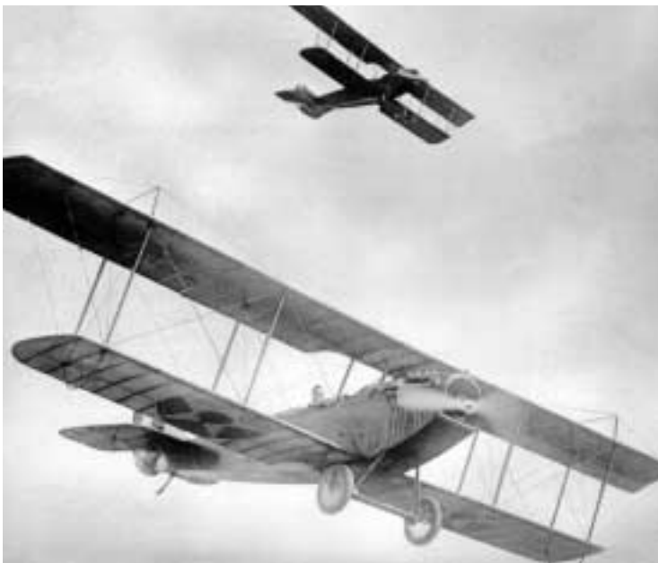
Many Air Service pilots first learned to fly in the Curtiss JN-4 “Jenny.”