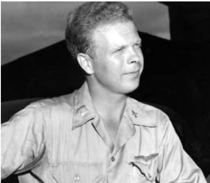
Capt. Richard I. Bong, the leading U.S. ace during World War II

December 27: Second Lt. Richard I. Bong, flying a P-38 against the Japanese in the Pacific, scored his first two aerial victories. By the end of the war, he had earned 40 such credits, making him the top U.S. ace.