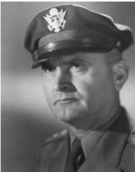
Lt. Gen. Ira C. Eaker, commander of Eighth Air Force in 1943, directed early U.S. heavy bomber raids over Europe.

February 17: Allied Force Headquarters constituted and activated Mediterranean Air Command under Air Chief Marshal Sir Arthur Tedder of Great Britain. It included three commands: Northwest African Air