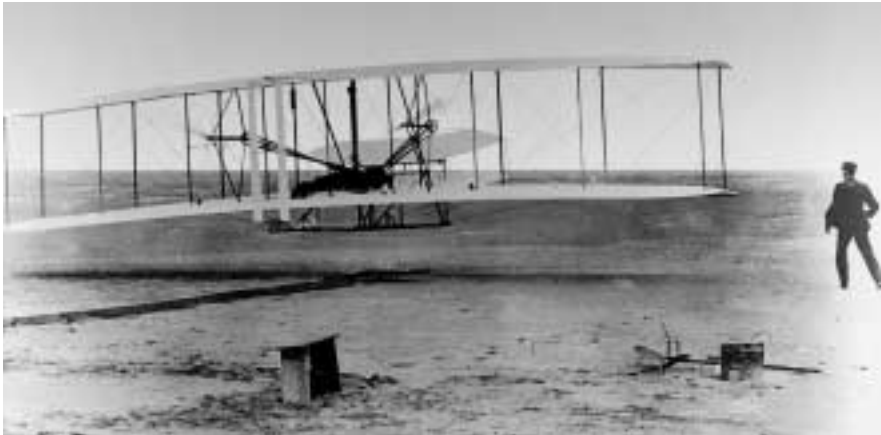
The first powered and controlled airplane flight at Kitty Hawk, North Carolina

December 17: Orville and Wilbur Wright piloted a powered heavier-than-air aircraft for the first time at Kill Devil Hill, near Kitty Hawk, North Carolina. Controlling the aircraft for pitch, yaw, and roll, Orville completed the first of four flights, soaring 120 feet in 12 seconds. Wilbur completed the longest flight of the day: 852 feet in 59 seconds. The brothers launched the airplane from a monorail track against a wind blowing slightly more than 20 miles per hour.