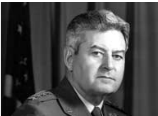
Gen. Curtis E. LeMay became commander of Strategic Air Command in 1948 and chief of staff of the Air Force in 1961.

February 20: Strategic Air Command received its first B-50 Superfortress bomber, an improved version of the B-29 with larger engines, a taller tail fin and rudder, and equipment for in-flight refueling.