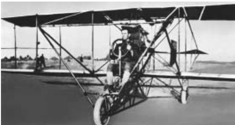
An early Curtiss aircraft equipped with a steering wheel

August 4: Elmo N. Pickerill made the first radio-telegraphic communication between the air and ground while flying solo in a Curtiss pusher from Mineola, Long Island, to Manhattan Beach and back.