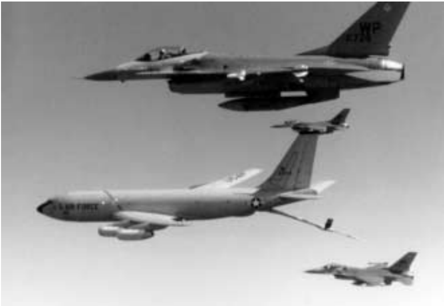
The KC-135 Stratotanker, the first jet tanker in the USAF inventory, refueled a variety of aircraft, including F-16 fighters, pictured here.