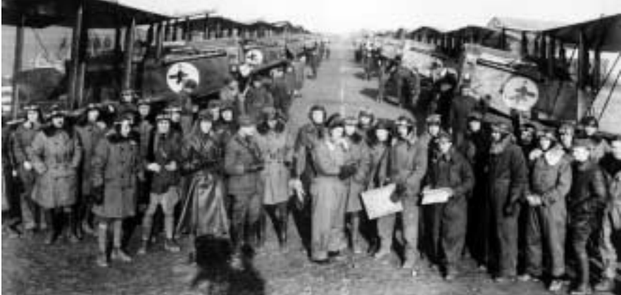
Personnel of the 11th Aero Squadron Day Bombardment, Maulan, France, 1918