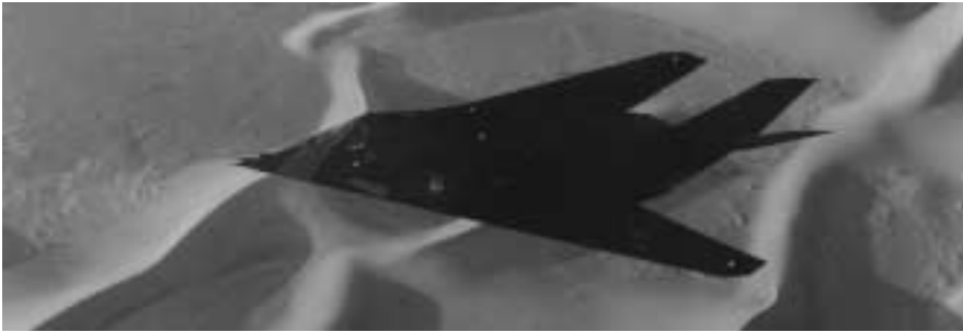
The F-117A Nighthawk