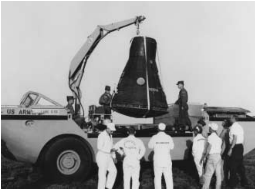
Recovery of Mercury capsule Freedom 7 on May 5, 1961

May 5: By making a suborbital flight in Mercury capsule Freedom 7 , Cmdr. Alan B. Shepard, Jr., United States Navy, became the first U.S. astronaut in space.