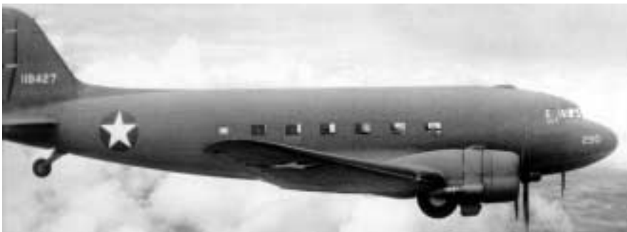
The Douglas C-47 Skytrain, derived from the DC-3 commercial airliner of the 1930s, served the Army Air Forces during World War II and the Air Force for decades after the war.

November 8: Operation TORCH, the Anglo-American invasion of North Africa, began with amphibious landings in Morocco and Algeria. Twelfth Air Force supported the invasion with troop-carrying C-47s of the 60th Troop Carrier Group and Spitfire fighters of the 31st Fighter Group.