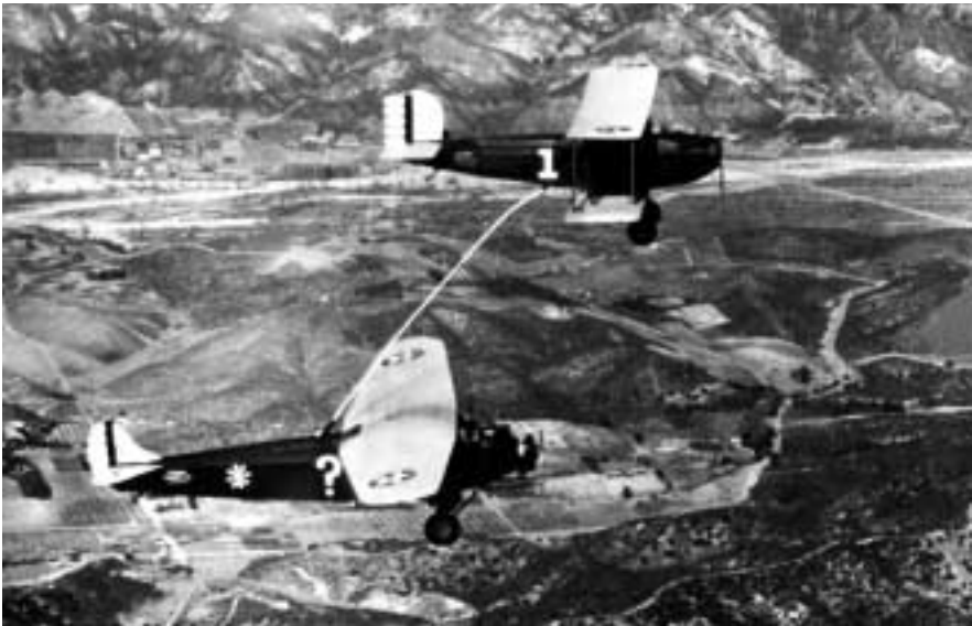
The Question Mark set a flight-endurance record in 1929.