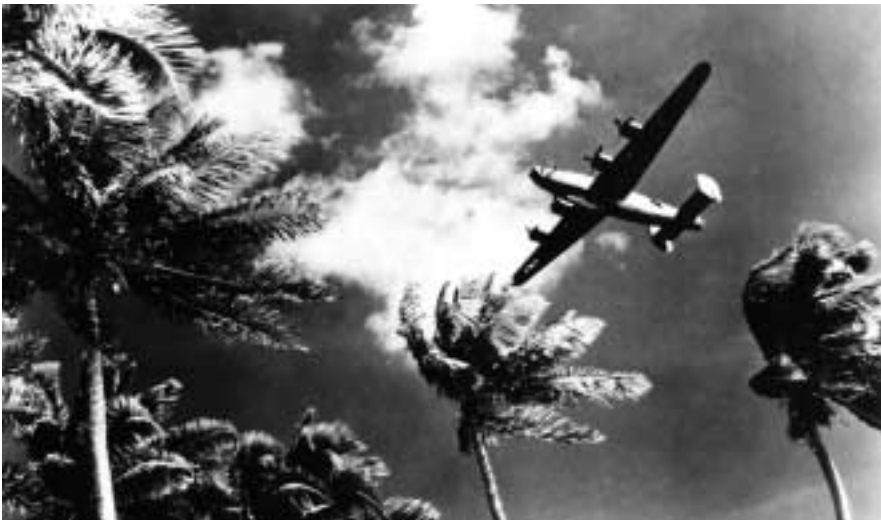
The B-24 Liberator heavy bomber

June 16: The Consolidated B-24 Liberator, a four-engine bomber that could fly faster and farther than the similarly sized B-17, entered the Air Corps inventory. More than 18,000 B-24s were produced during World War II, a greater number than any other U.S. aircraft.