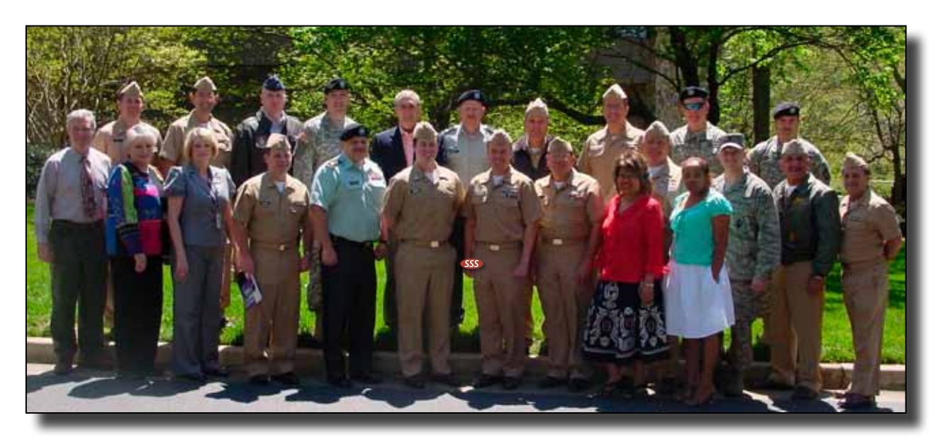
REGION II NEW OFFICER / STATE DIRECTOR TRAINING CLASS 2009 — Graduating class for Region II New Officer / State Director Phase II training conducted April 16 – 19, 2009, along with the Region II staff. The class included officers from the U.S. Navy Reserve, Air Force Reserve, and Army National Guard. Phase II training consisted of a Region Headquarters orientation, mini-version of the Initial Board Member Training, and the Selective Service System Professional Development Course.

The training went exceptionally well and the Region III staff provided professional guidance throughout.