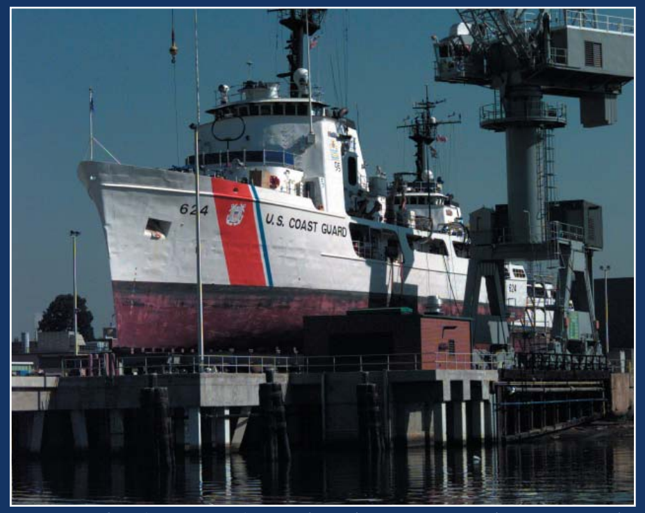
CGC Dauntless (WMEC 624) recently underwent MEP at the Coast Guard Yard, Curtis Bay, Md.

The Mission Effectiveness Project (MEP) is a highly successful result of the close coordination between the Acquisition Directorate, the Engineering and Logistics Directorate, the Surface Forces Logistics Center, and the Coast Guard Yard at Curtis Bay, Md. To date, the project has extensively refurbished and delivered on time and within budget, eight (of 20) 110-foot patrol boats (WPBs) and eight (of 14) 210-foot medium endurance cutters (WMECs), and also successfully completed seven (of 26) shipyard availabilities for the 13 270-foot WMECs (which require two availabilities per cutter). The MEP reduces maintenance and operating costs, replaces unsupportable systems, and ensures that these legacy platforms can meet mission requirements until replaced by new vessels.