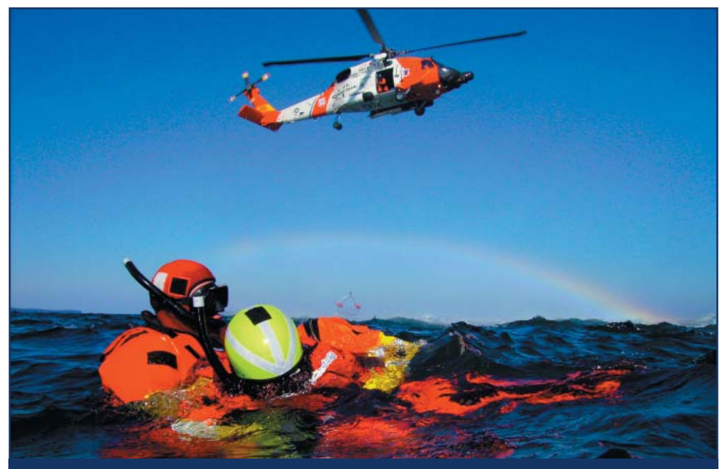
R&D tools like the Multi-Sensor Performance Prediction (MSPP) tool and Sensor Performance Optimization Tool (SPOT) help the Coast Guard's operating forces save lives. Rescue swimmers from Coast Guard Air Station Kodiak, Alaska, wait for a basket pickup by an MH-60 Jayhawk helicopter during open water training.

"MSPP has the capability to accurately model the sensor, the environment and the [contact] to predict search performance against [contacts] that were not included in field testing," Capt. Sisson explained.