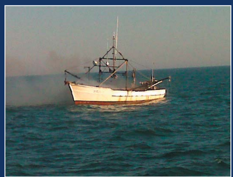
The skipper of the crippled fishing vessel, Beau Vin, survived because the Coast Guard received his 406 MHz Emergency Position Indicating Radio Beacon (EPIRB) signal.

As the world's commercial and recreational distress radio signal networks have switched to the 406MHz frequency standard, the Coast Guard is improving the ability of its aircraft to receive those transmissions. Since January 2007, the United States and other governments have been phasing out the older 121.5MHz signal standard. Today, most vessels are equipped with Emergency Position Indicating Radio Beacons (EPIRBs) and Emergency Locator Transmitters (ELTs) that broadcast in the 406MHz band. A new 406MHz multi-mission direction finding receiver, called the DF-430-F (which can still pick up 121.5MHz signals), is now installed on 89 Coast Guard fixed wing and rotary wing aircraft. The Coast Guard Aviation Logistics Center has completed installations aboard the entire operational fleet (29 aircraft) of HC-130H and HC-130J Hercules long range surveillance aircraft. Additionally, 31 MH-65C Dolphin multi-mission cutter helicopters, 20 HU-25 Falcon medium range surveillance aircraft, seven HC-144A Ocean Sentry maritime patrol aircraft, and two MH-60T Jayhawk medium range recovery helicopters now feature the DF-430-F system. All Coast Guard aircraft are scheduled to be equipped with the DF-430-F by 2012.