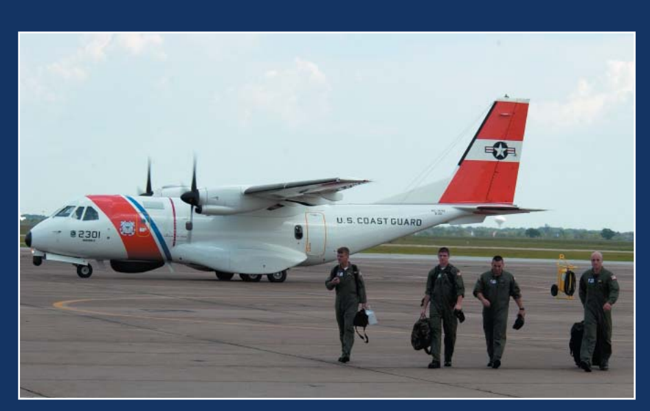
An HC-144A Ocean Sentry prepares to taxi on the tarmac at Houston.

Ready to take centerfield, the HC-144A Ocean Sentry medium-range maritime patrol aircraft achieved Initial Operational Capability (IOC) on April 2, 2009. Cleared for operational use by the Coast Guard's Assistant Commandant for Capability (CG-7) under guidelines described by the service's requirements documentation, the Ocean Sentry will perform a variety of tasks, including those of search and rescue; drug interdiction; migrant interdiction; other law enforcement; and transport missions. The HC-144A acquisition project so far has delivered seven of 36 aircraft, and three of 12 Mission System Pallets currently under contract.