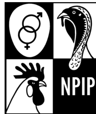
NATIONAL POULTRY IMPROVEMENT PLAN

NPIP participants are entitled to use on their packaging the NPIP emblem reproduced here: