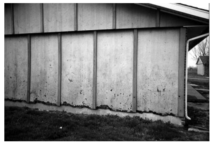
Decaying siding is representative of conditions found in apartment complexes managed by the realty company.

A realty company and an identity of interest (IOI) reinsurance firm set in motion an insurance program which did not meet requirements of RHS regulations and did not comply with national office directions. From July 1992 through July 1998, the realty company withdrew insurance premiums, totaling about $4.3 million, from project accounts without providing satisfactory protection for projects securing RHS loans. While the realty company originally told RHS the IOI firm would save money, projects were actually charged excessive premiums. For example, annual insurance costs for the realty company's Missouri projects exceeded the State average by about $113,000. The realty company and the IOI firm did not respond to repeated agency directions to reduce insurance costs. In addition, the realty company and the IOI firm arranged outside financing, costing an estimated $3,500 annually in interest, to pay insurance premiums for 55 projects.