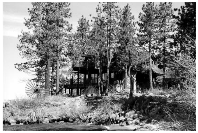
View of the mansion at Zephyr Cove.

The $38 million exchange failed to obtain clear title to a unique lakeshore property, now fenced off, restricting public access. The $38 million cost to the Government potentially is double the land's actual value. We concluded that the Zephyr Cove land exchange was seriously compromised by the inadequate actions of the FS regional office and the local FS personnel working the exchange. Also, as a result of the sale of the mansion at Zephyr Cove, a third party threatened litigation if FS did not issue it a special-use permit at a low rate to operate a concession in the mansion and develop the land around it.