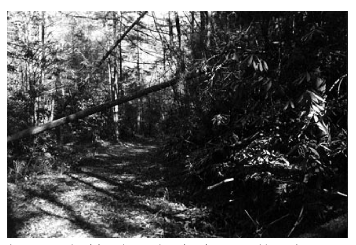
As an example of the misreporting of performance, this road was improperly reported to be a stream.

We recommended that FS develop and implement a comprehensive strategy to ensure the collection and reporting of accurate, complete, and meaningful performance data that include effective internal controls. We recommended that the agency continue the process of establishing, publishing, and ensuring adequate written guidance defining each performance measure and setting forth the documentation needed to support reported accomplishments. Until the agency can provide reasonable assurance of the quality of its Annual Performance Reports, FS should report the lack of an effective system of internal controls over performance reporting as a material weakness in the Federal Managers' Financial Integrity Act report.