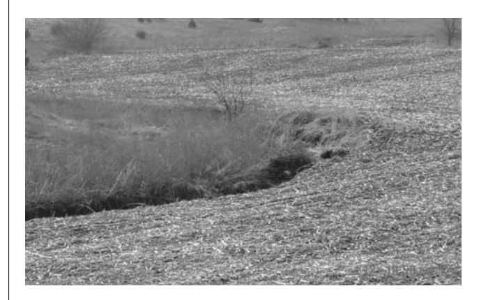
Our site visit to a participant's farm disclosed that a stream was not protected by a required 20-foot buffer.

from receiving payments from multiple contracts. NRCS did not independently verify applicant-supplied information before approving contracts. We also identified 12 producers with multiple contracts who received improper payments totaling $433,687. In addition, NRCS did not ensure ongoing compliance through monitoring of conservation efforts of participants' land over the course of their contracts.