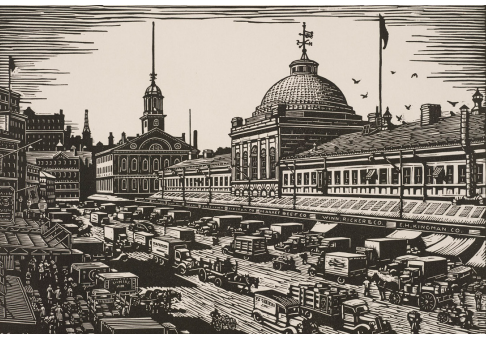
Image of Faneuil Hall and Quincy Market

September 2012 SUNDAY MONDAY TUESDAY WEDNESDAY THURSDAY FRIDAY SATURDAY