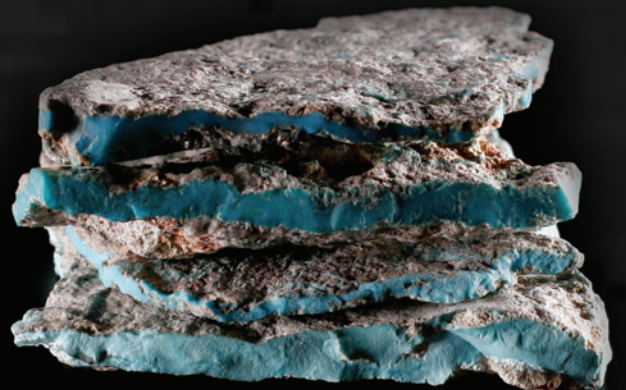
Gradations of turquoise color

Most consumers will ask if the turquoise is "real," but the question to ask is if it is "natural" turquoise.