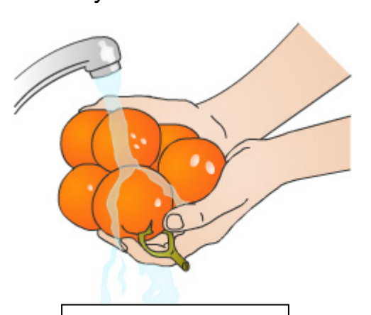
Wash Fruits and Vegetables