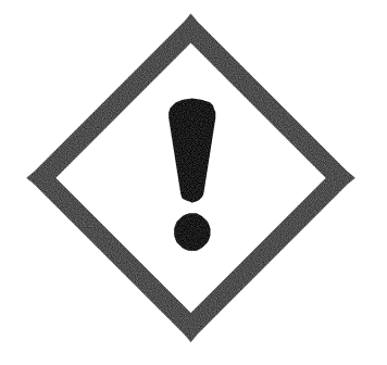
Figure C.2 – Exclamation Mark Pictogram

C.2.3.3 Where a pictogram required by the Department of Transportation under Title 49 of the Code of Federal Regulations appears on a shipped container, the pictogram specified in C.4 for the same hazard shall not appear.