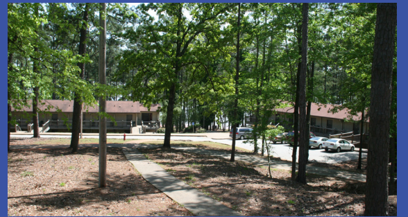
For more information and driving directions: www.hickoryknobresort.com