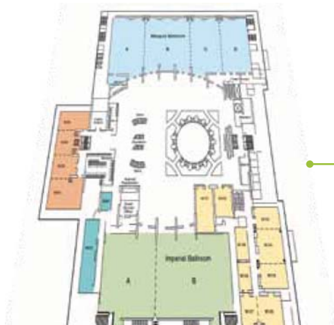
Marquis level (ML)