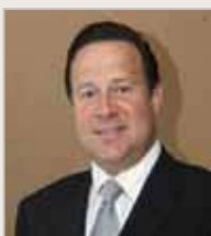
Panelist: His Excellency Juan Carlos Varela Vice President of the Republic of Panama