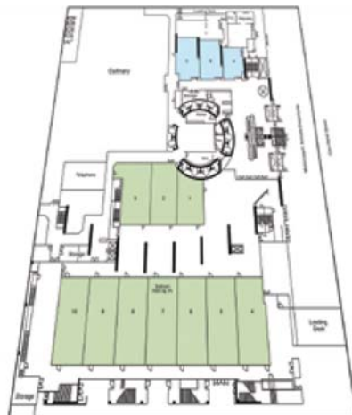
International level (IL)