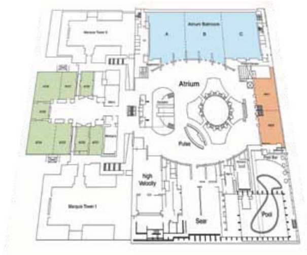
Atrium level (AL)