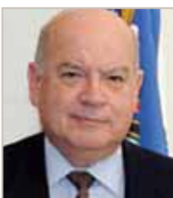
Panelist: José Miguel Insulza Secretary General of the Organization of American States