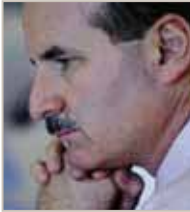
Panelist: José María Figueres Olsen CEO, Concordia 21

José María Figueres served as President of Costa Rica from 1994 to 1998. As such, he was the youngest President of a Central American country in modern times. During his presidency, he created a comprehensive national Sustainable Development strategy combining sound macroeconomic indicators, together with strategic investment in human development, and a strong alliance with nature through the implementation of innovative environmental policies. Prior to serving as President he was Minister of Foreign Trade (1987-1988) and Minister of Agriculture (1988-1990).