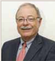
Panelist: His Excellency Luis Liberman Ginsburg Second Vice President of the Republic of Costa Rica

Vice President Garzón represented Colombia as Ambassador to the United Nations in Geneva (most notably the International Labor Organization) from January 2009 until March 8, 2010, when he became a candidate for Vice President of Colombia. He also participated in the Carter Center's mediation efforts to reestablish relations between Colombia and Ecuador. Vice President Garzón has been a strong supporter of the U.S.-Colombia Trade Promotion Agreement (CTPA) and even accompanied President Uribe to lobby the U.S. Congress in June 2007.