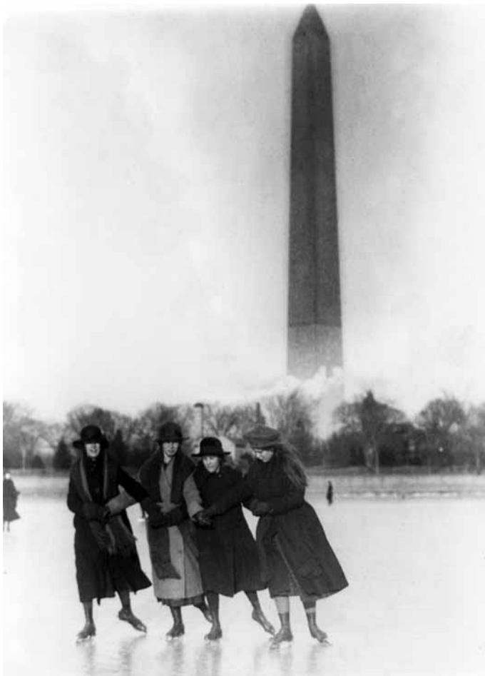
Ice skating with the Washington Monument in the background, 1919 Courtesy of the Library of Congress, LC-USZ62-93059.