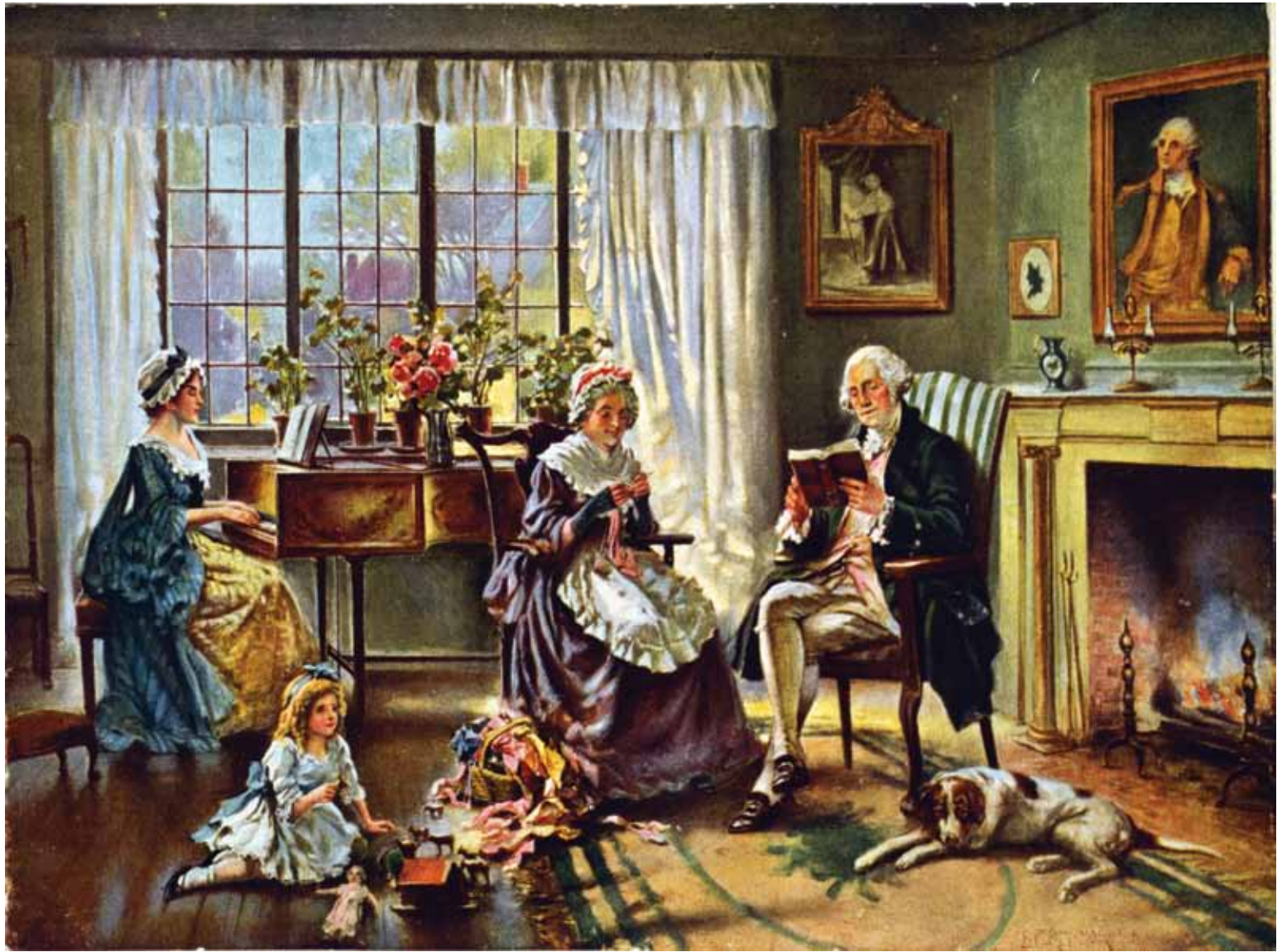
"Washington at Home" by E. Percy Moran