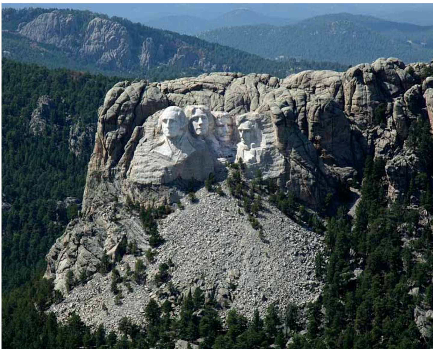
Aerial view, Mount Rushmore, near Keystone, South Dakota