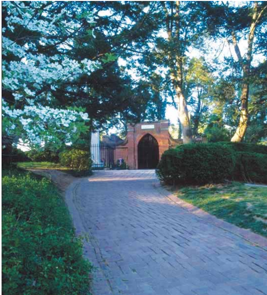
Washington's Tomb at Mount Vernon