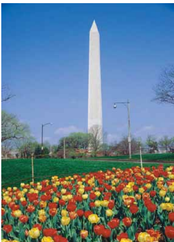
Flower bed in front of Washington Monument USCIS has licensed the use of this photo. It is not in the public domain.