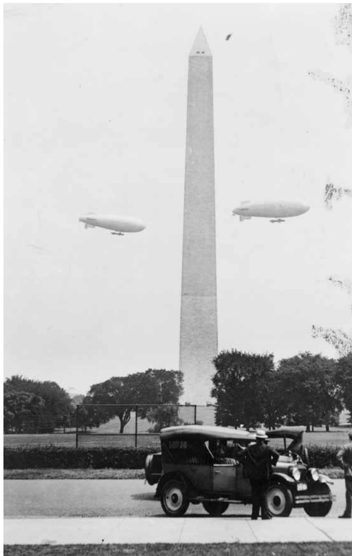
U.S. Army blimps, the T.C. 5 and T.C. 9, from Langley Field, VA, passing over the Washington Monument during a practice flight between 1920 and 1932.