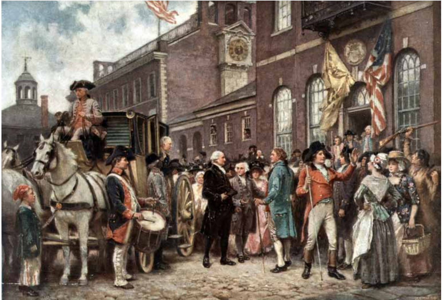
"Washington's Inauguration at Philadelphia" by Jean Leon Gerome Ferris Courtesy of the Library of Congress, LC-USZC4-12011.