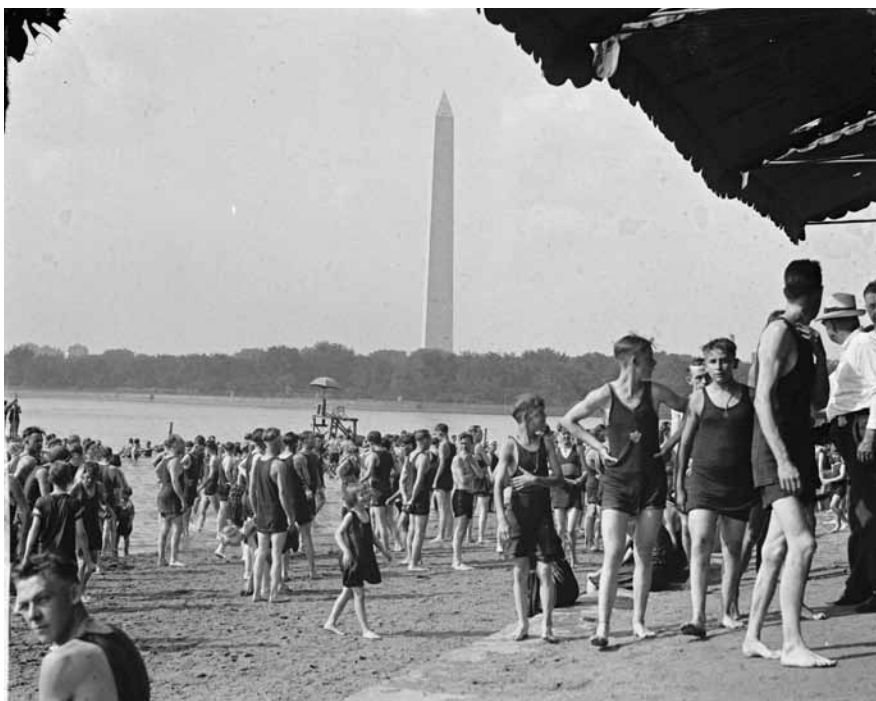
Bathing Beach, Washington Monument in background, 1922 Courtesy of the Library of Congress, LC-DIG-npcc-06676.