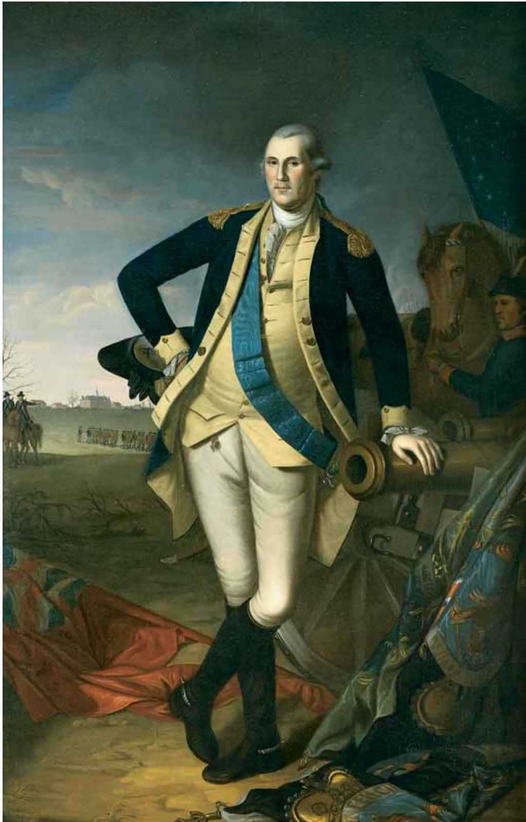
"George Washington at Princeton" by Charles Willson Peale