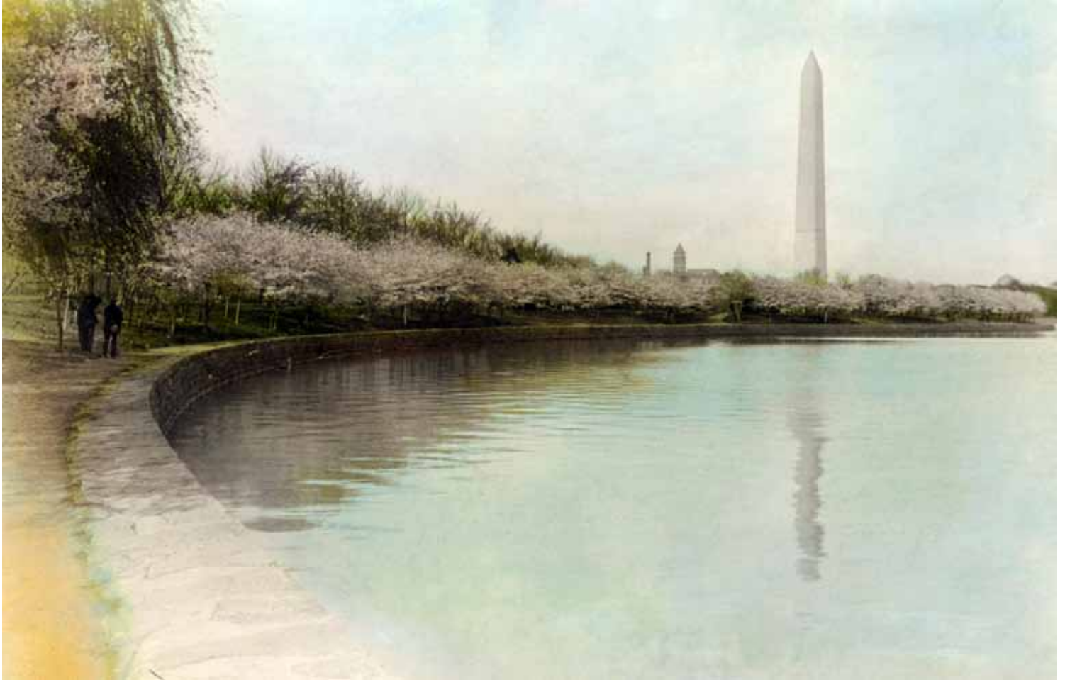
View from Tidal Basin, with cherry blossoms, and Washington Monument in background, Washington, D.C. Courtesy of the Library of Congress, LC-USZC4-5297.