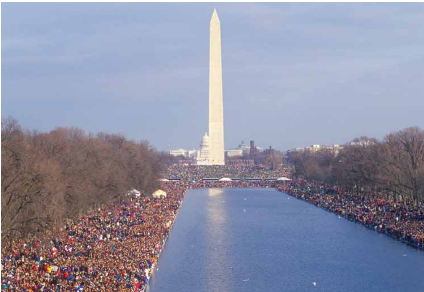
Crowd at President Clinton's Inauguration, The Washington National Monument, Washington, DC USCIS has licensed the use of this photo. It is not in the public domain.