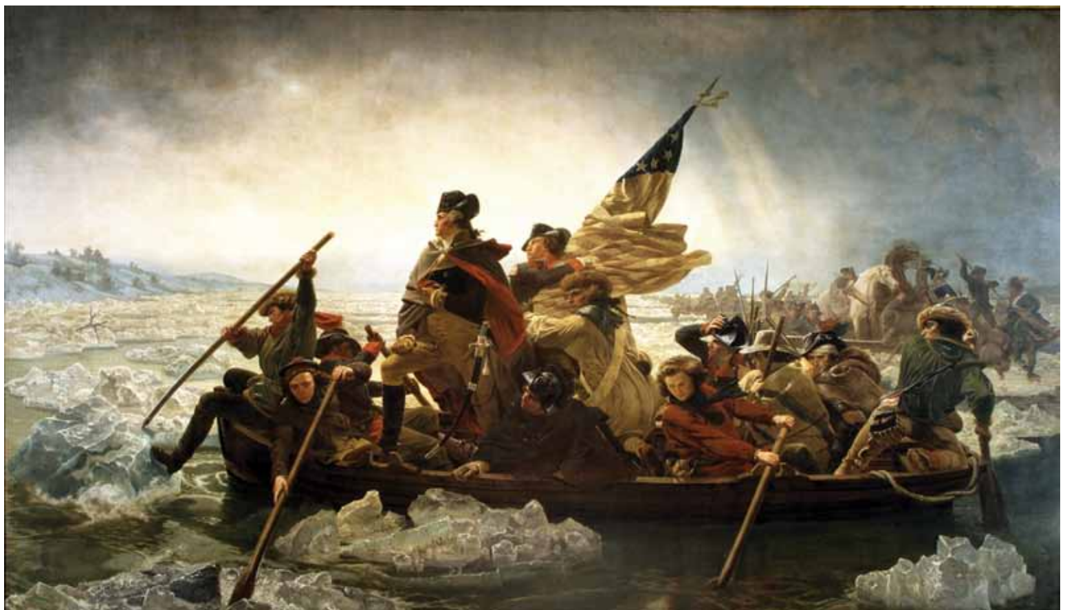
"Washington Crossing the Delaware" by Emanuel Leutze