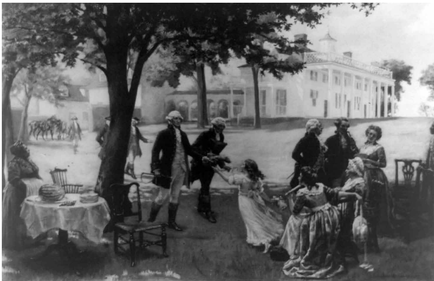
"Return From the Fox Hunt, Mt. Vernon" by John Ward Dunsmore Courtesy of the Library of Congress, LC-USZ62-77268.