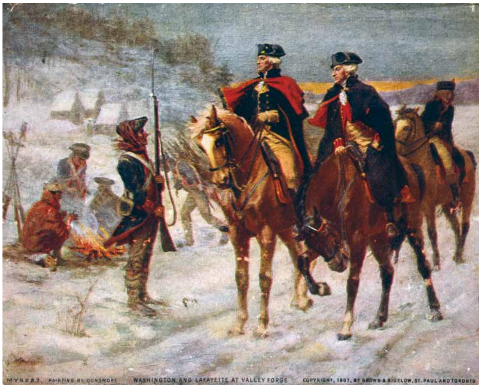
"Washington and Lafayette at Valley Forge" by John Ward Dunsmore Courtesy of the Library of Congress, LC-USZC4-6877.