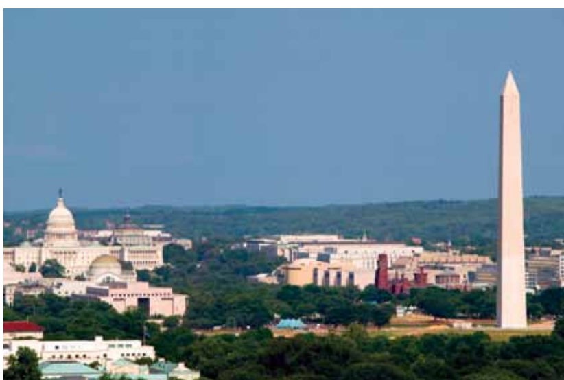
Washington, DC USCIS has licensed the use of this photo. It is not in the public domain.