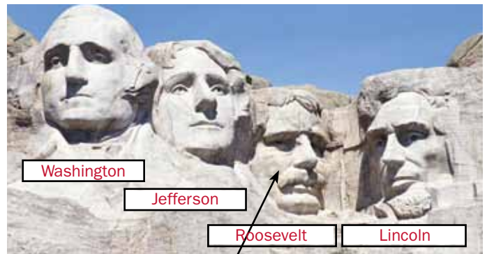
Theodore Roosevelt (1901–1909)