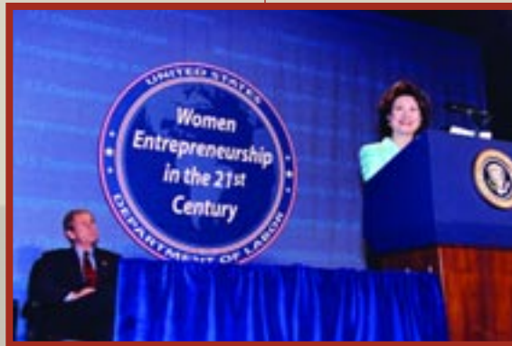
PRESIDENT GEORGE W. BUSH LOOKS ON AS SECRETARY ELAINE L. CHAO ADDRESSES ATTENDEES AT THE MARCH, 2002 CONFERENCE ON WOMEN ENTREPRENEURSHIP IN THE 21ST CENTURY.