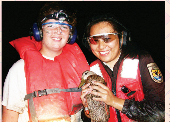
Migratory bird banding is an essential mangagment tool.