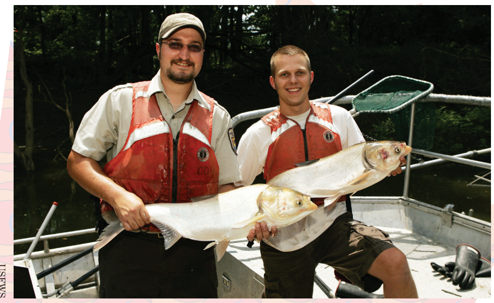
A fish biologist and an SCA student monitor the status of inter-jurisdictional fisheries as part of a management plan.

For more information, please contact your servicing Human Resources Office or the Department of the Interior, Office of Youth and Natural Resources, at (202) 208-4417.