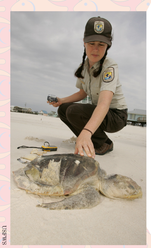
A biological technician examines a sea turtle carcass that has washed ashore to help determine the cause of death.

youth of all ages. Increases include $2 million for the FWS and Bureau of Land Management to join with the National Fish and Wildlife Foundation in public-private partnerships to promote priority