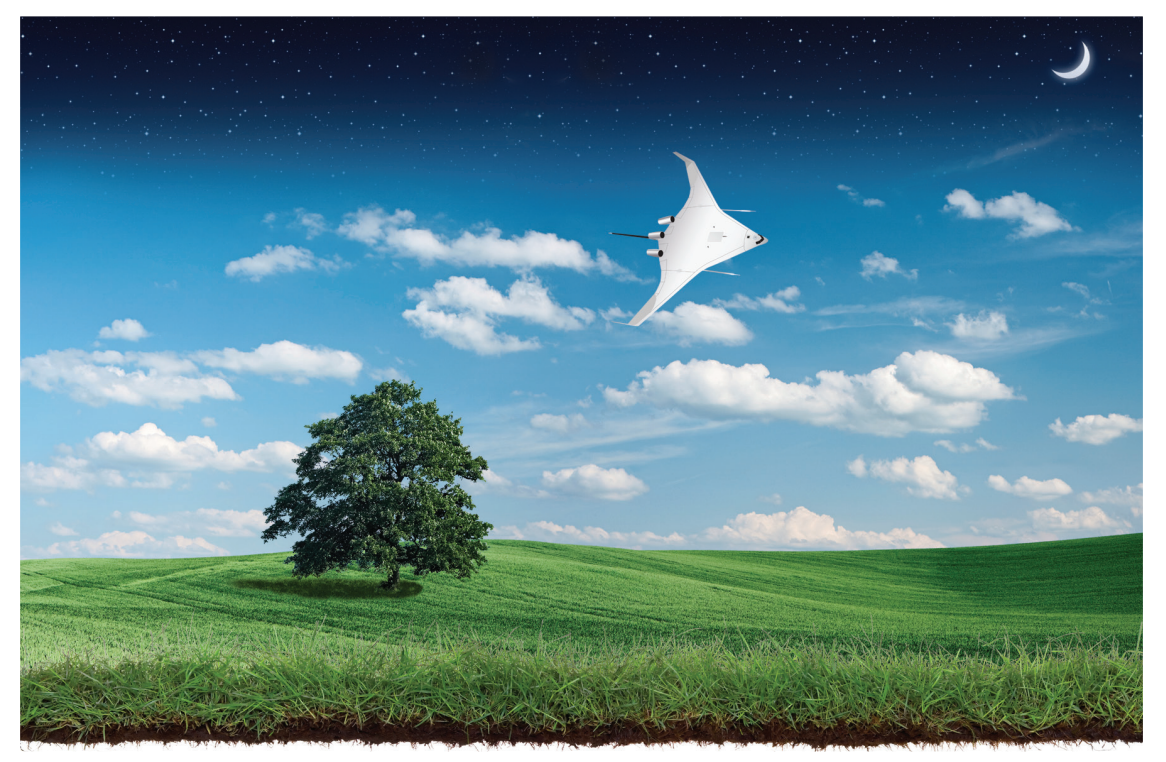
NASA's goal is to reduce aircraft fuel consumption, emissions and noise simultaneously.