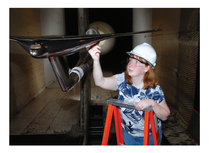
Wind tunnels, simulators and other testing facilities help answer key, early questions about the promise of technology options.

Within the Environmentally Responsible Aviation Project, research toward achieving the simultaneous goals described earlier is organized into three main areas: