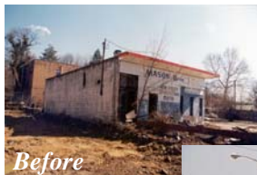
Old abandoned gas station site becomes new firehouse, Trenton, NJ

The Agency accomplished a great deal in the year since the Action Plan was published. A list of the accomplishments and ongoing activities is provided below. The Action Plan and other information on petroleum brownfields are available on EPA's petroleum brownfields Web site http://www.epa.gov/oust/petroleumbrownfields .