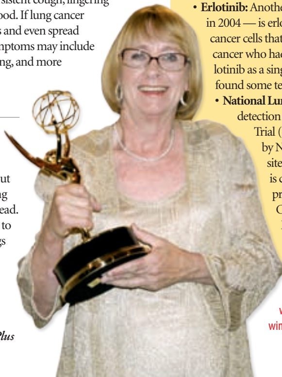
Actress Kathryn Joosten, ex-smoker and lung cancer survivor, was the president's secretary on The West Wing and an Emmy winner for Desperate Housewives.