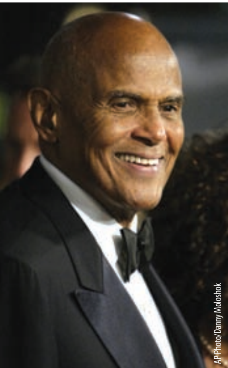
Singer Harry Belafonte has been vocal in his discussion of his prostate cancer and the need for early screening.

Physicians now use a prostate-cancer grading formula called the Gleason system that assigns prostate cancers a score from 2 to 10. The higher your Gleason score, the more likely it is that your cancer will grow and spread quickly.