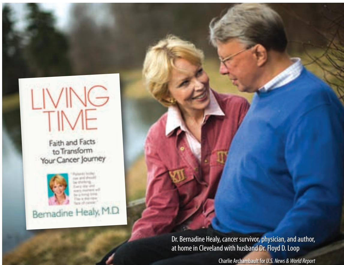
Dr. Bernadine Healy, cancer survivor, physician, and author, at home in Cleveland with husband Dr. Floyd D. Loop

“Cancer used to be viewed as a certain death sentence, and that was exactly how I viewed my prognosis on that night in 1999 [when diagnosed],” writes Dr. Healy. “But nowadays we have a new outlook on cancer, and it’s a veritable sea change ... For most on cancer’s path, it is no longer the end of life but the beginning of life’s challenging next stage.”