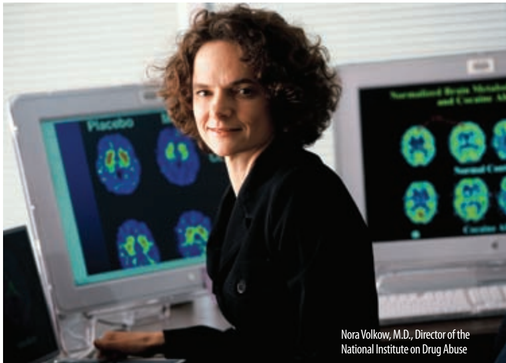
Nora Volkow, M.D., Director of the National Institute on Drug Abuse

With nearly one in 10 Americans over the age of 12 classified with substance abuse or dependence, addiction takes an emotional, psychological, and social toll on the country. The economic costs of substance abuse and addiction alone are estimated to exceed a half trillion dollars annually in the United States due to health care expenditures, lost productivity, and crime.