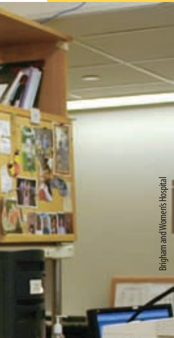
Brigham and Women's Hospital

To find out more about the study, call the NIH Patient Recruitment and Public Liaison Office at 1-800-411-1222. The e-mail address is prpl@mail.cc.nih.gov . Information about the study is also available from http://fibroids.nichd.nih.gov/criteria.html .