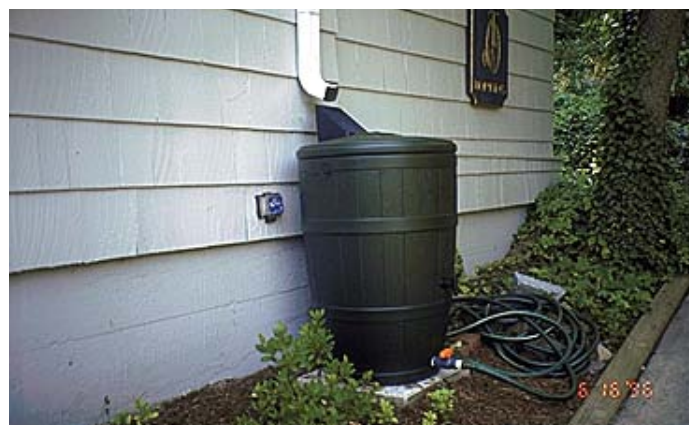
Rain barrels are appropriate for residential settings.

A nonprofit organization that provides technical tools for protecting water resources to local governments, activists, and watershed organizations. The Center has developed a number of excellent publications pertaining to site design and watershed protection.