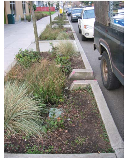
Curb cuts allow water from the street to flow into bioretention areas

Allow time and dedicate staff resources for bringing design engineers and landscape architects up to speed on new requirements. Provide checklists to help ensure compliance with new procedures. Develop locally based coefficients where appropriate in order to streamline sizing calculations and include example calculations to ensure consistency and transparency in project submittals. Hold periodic training sessions on LID applications, and request that plan reviewers provide specific comments when submitted designs do not meet standards.