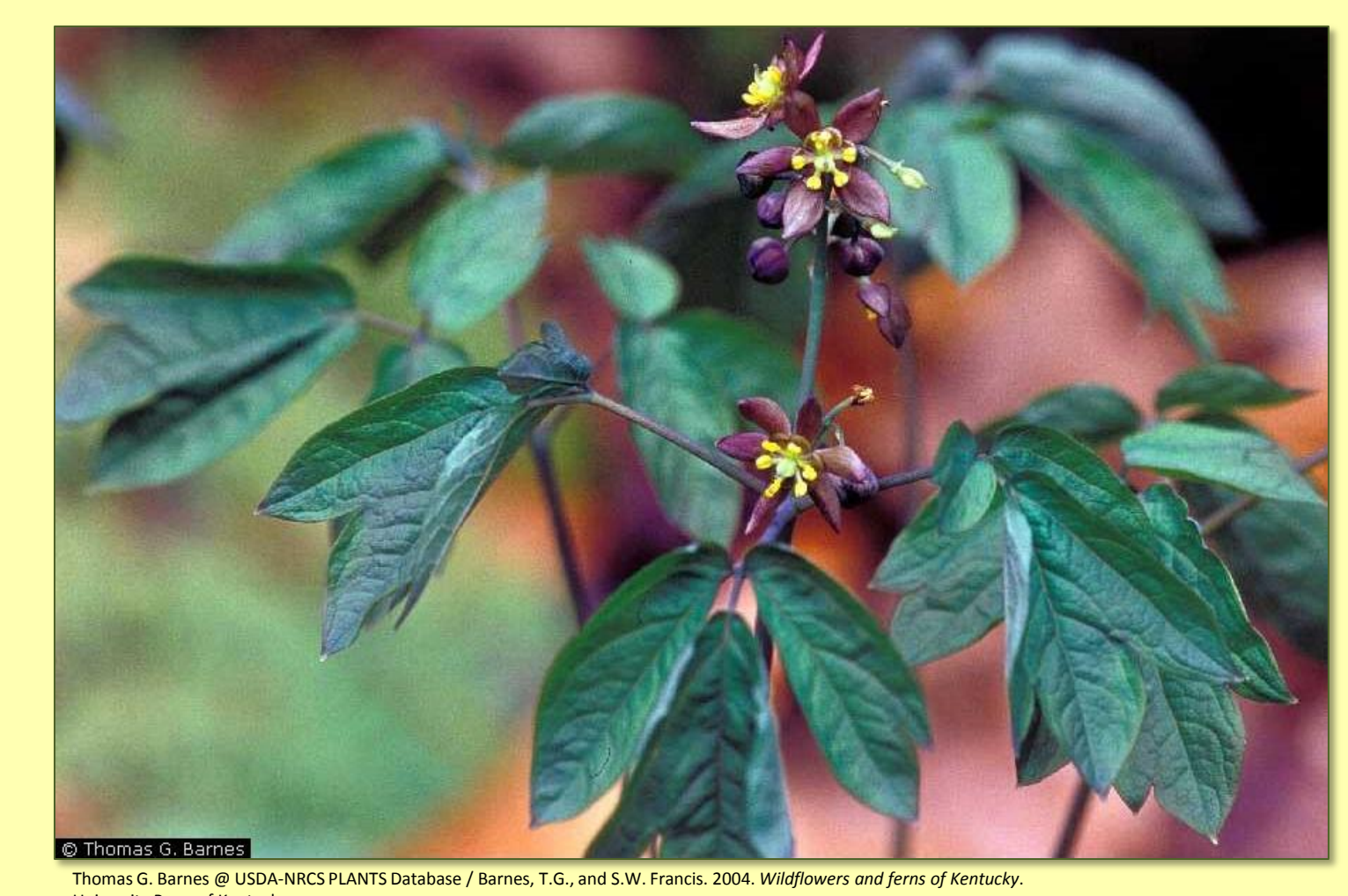
Blue cohosh (Caulophyllum thalictroides), a medicinal plant, was also called Papoose-root by Native Americans, as it was used to induce labor.