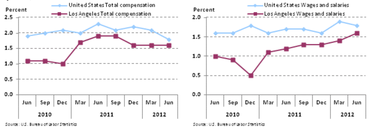
Chart 1. Twelve-month percent changes in the Employment Cost Index for total compensation and for wages and salaries, private industry workers, United States and the Los Angeles area, not seasonally adjusted, June 2010 - June 2012

The "Employment Cost Index for the Regions" news releases have been discontinued. However, the estimates that appeared in those releases are available in table 6 (www.bls.gov/news.release/eci.t06.htm) and table 10 (www.bls.gov/news.release/eci.t10.htm) of the "Employment Cost Index" news release issued by the BLS National Office. Historical estimates for these series can be found at www.bls.gov/ncs/ect/regionaleci.htm.