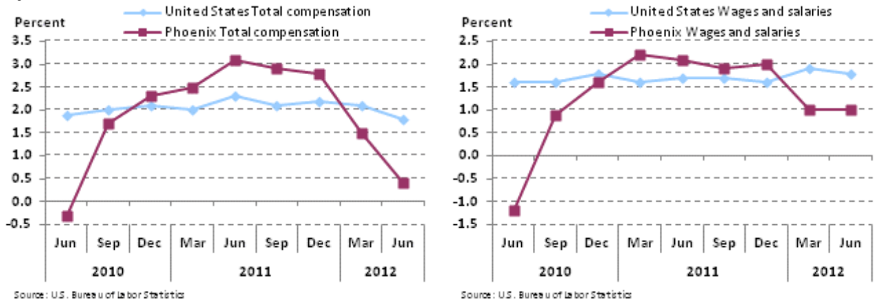
Chart 1. Twelve-month percent changes in the Employment Cost Index for total compensation and for wages and salaries, private industry workers, United States and the Phoenix area, not seasonally adjusted, June 2010 - June 2012

The "Employment Cost Index for the Regions" news releases have been discontinued. However, the estimates that appeared in those releases are available in table 6 (<u>www.bls.gov/news.release/eci.t06.htm</u>) and table 10 (<u>www.bls.gov/news.release/eci.t10.htm</u>) of the "Employment Cost Index" news release issued by the BLS National Office. Historical estimates for these series can be found at <u>www.bls.gov/ncs/ect/regionaleci.htm</u>.