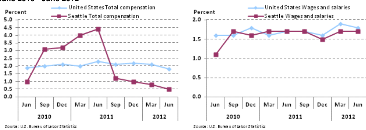
Chart 1. Twelve-month percent changes in the Employment Cost Index for total compensation and for wages and salaries, private industry workers, United States and the Seattle area, not seasonally adjusted, June 2010 - June 2012

The "Employment Cost Index for the Regions" news releases have been discontinued. However, the estimates that appeared in those releases are available in table 6 (<a href="www.bls.gov/news.release/eci.t06.htm">www.bls.gov/news.release/eci.t06.htm</a>) and table 10 (<a href="www.bls.gov/news.release/eci.t10.htm">www.bls.gov/news.release/eci.t10.htm</a>) of the "Employment Cost Index" news release issued by the BLS National Office. Historical estimates for these series can be found at <a href="www.bls.gov/ncs/ect/regionaleci.htm">www.bls.gov/ncs/ect/regionaleci.htm</a>.