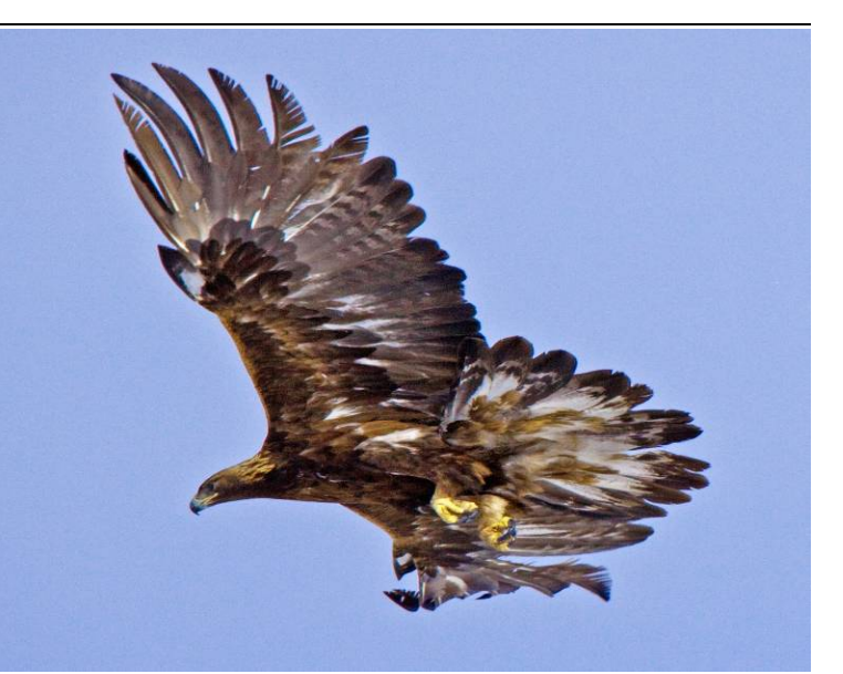
Juvenile golden eagle in flight, Las Vegas NWR, NM. The Service's objective is to maintain stable or increasing populations of golden eagles as we transition to newer renewable forms of energy.

The regulation of take is a primary Service activity that uses current data and coordination with the states and Tribes to evaluate the status of migratory bird populations. For example, various