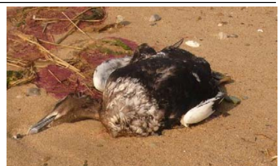
Male common eider in Massachusetts killed by the newly discovered Wellfleet Bay virus.

The Migratory Bird Program has built upon its avian influenza surveillance activities of the previous few years to establish a nationwide Avian Health and Disease Program that supports the avian conservation,