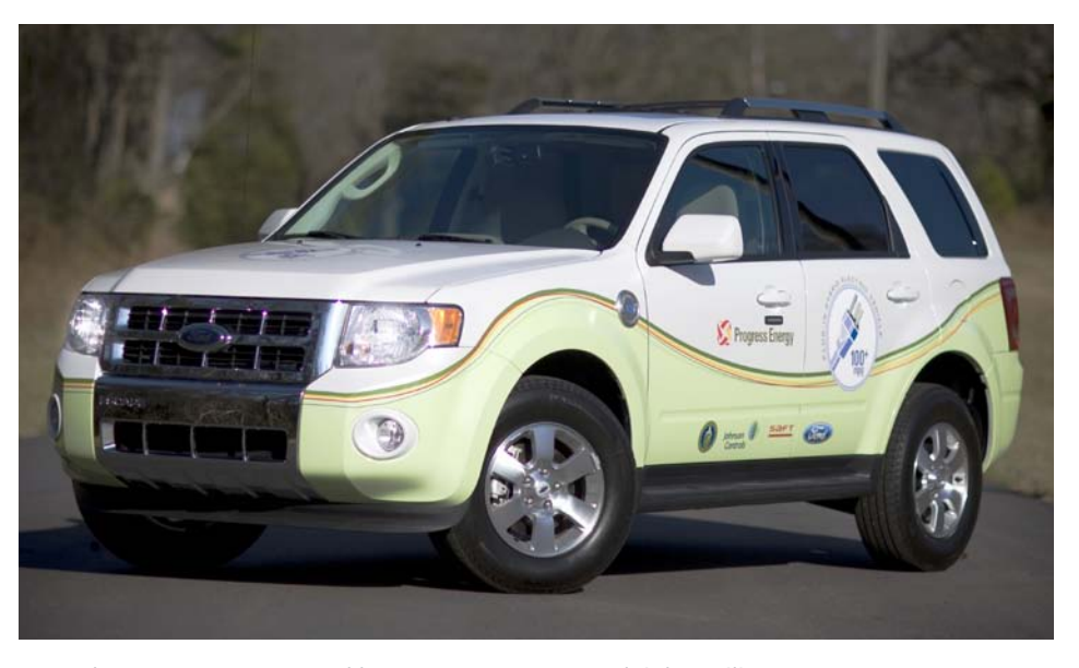
A Ford Escape PEV operated by Progress Energy, Raleigh's utility.

Fast-growing, high-tech Raleigh—and the surrounding Research Triangle Region—became PEV leaders by joining Project Get Ready in 2009. One of the first steps was assembling a diverse