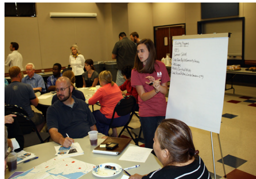
Texas Hunger Initiative Joins Let’s Move Faith and Communities to Serve Summer Meals The Texas Hunger Initiative (THI) joined Let’s Move Faith and Communities to help folks serve meals to the one in four children in Texas who don’t get enough to eat every summer.