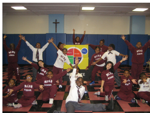
A Catholic School in Harlem Turns MyPlate into a School Musical Elementary students at Mt. Carmel Holy Rosary turn healthy eating lessons into a school musical about MyPlate.

Read the success stories below about how others have made MyPlate work in their community.