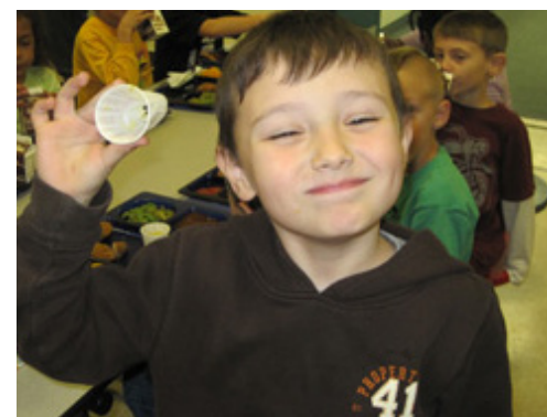
MOGO: A Wisconsin County on the Move! A Monroe County elementary school student displays nothing but smiles after participating in a vegetable taste test.