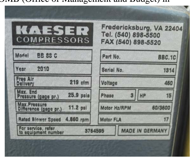
Kaeser blower label, indicating product was made in Germany.

As a result of a subsequent site visit, the city provided documentation from Kaeser Compressors, Inc., dated October 29, 2010, to support substantial transformation. The letter stated that for Recovery Act-funded projects, Kaeser Compressors, Inc., purchases a base chassis of proprietarily designed components from the parent company, Kaeser