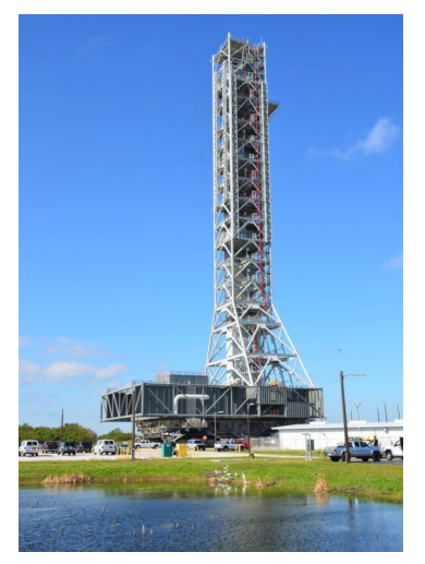
Figure 1. The Ares I Mobile Launcher at Kennedy Space Center on November 30, 2011.

NASA's newest Mobile Launcher was designed and built at Kennedy Space Center to support assembly, testing, transportation, and launch of the Constellation Program's Ares I launch vehicle.<sup>1</sup> The Mobile Launcher, completed in August 2010 at a cost of $234 million, consists of a two-story base, a 355-foot-tall launch umbilical tower, and facility ground support systems that include power, communications, and water.