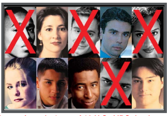
Approximately 4 out of 10 U.S. AIDS deaths are related to drug abuse.

While anyone can be affected by HIV, some populations are at increased risk due to a number of complex biological, social, and economic factors. For example, while African Americans make up approximately 12 percent of the U.S. population, they accounted for half of the total AIDS cases diagnosed in 2003. Moreover, African-American women accounted for 69 percent of female HIV diagnoses during 2000-2003. In 2001, HIV infection was the leading cause of death for African-American women, aged 25-34, African-American men of all ages, and Hispanic women, aged 35-44. To address these disparities, NIDA is encouraging research to look at the relationship between drug abuse and the incidence/prevalence of HIV/AIDS and AIDS-related morbidity and mortality among these populations. The goal is to identify effective prevention and intervention approaches.