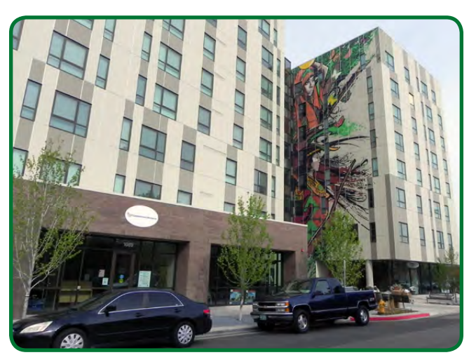
The Tapiz Apartments are a HUD-owned senior housing complex in La Alma/Lincoln Park. The building features a mural by a local artist.

FasTracks' new transit corridors and stations present the Denver region with many opportunities for transit-oriented development—walkable neighborhoods near transit stations that make it easy for people to visit, live, or work nearby without having to drive. After FasTracks passed, local jurisdictions began planning transit-oriented development on land near both existing and planned stations and formed partnerships with property owners, developers, and neighborhood leaders. The La Alma/Lincoln Park neighborhood hosts one of many redevelopment efforts now underway.