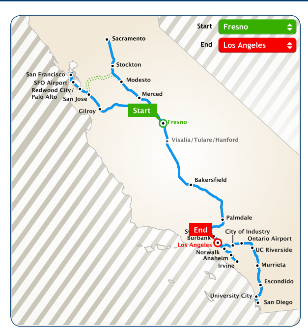
The High-Speed Rail project would benefit Fresno's downtown redevelopment and provide fast transit options to other California cities. The 255-mile trip from Fresno to Los Angeles, for example, would take 1 hour and 24 minutes.

The proposed 800-mile system would connect major cities with up to 26 stations. Fresno is slated to have the first station. Good planning will be essential to making the station an asset