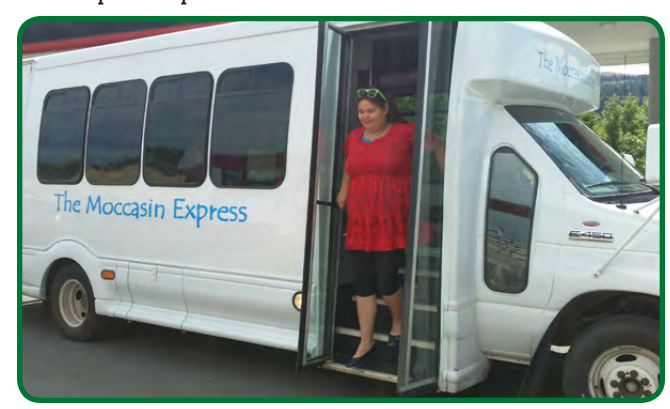
The Moccasin Express provides residents reliable transportation to jobs and amenities.

With a 47 percent unemployment rate on the reservation, the tribe is focused on supporting economic development and helping residents get better access to jobs. One strategy is to improve transportation choices; in 2008, the tribe completed a feasibility study that determined that lack of transportation options was the major reason for long-term unemployment. The study crystallized the problem and put in motion other requests for assistance. In 2009, the tribe received an FTA Tribal Transit Planning Grant to complete a transit development plan.