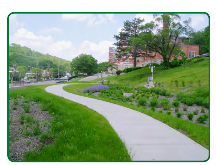
Rain gardens at the HUD-owned St. Francis Senior Apartments replaced excess pavement to reduce stormwater runoff. A monitoring station, pictured at right, measures runoff levels.

As part of an innovative settlement with EPA, the Metropolitan Sewer District of Greater Cincinnati is investigating integrated green and "gray" stormwater solutions instead of installing large drainage pipes (a typical "gray" solution).8 Although both designs can reduce stormwater runoff, the green alternative is less expensive and more attractive, and can produce more jobs. An important goal of the parties is the restoration of Lick Run, a stream in South Fairmount that was buried as the area developed. The sewer district hopes to achieve required runoff reductions by daylighting the stream and restoring the stream channel. The sewer district will submit this alternative approach for the combined sewer system to EPA for approval. If the pilot shows that