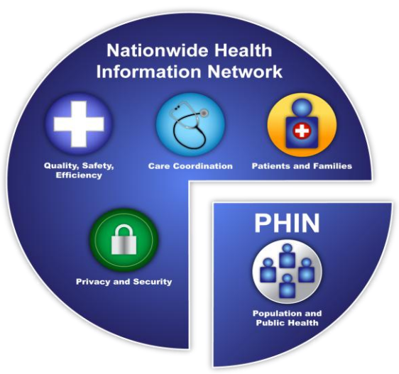
Figure 2 PHIN - The Population Health Portion of the Nationwide Health Information Network. PHIN will utilize and expand the Meaningful Use objectives, as well as the standards, services and policies of the Nationwide Health Information Network to advance population health outcomes and public health practice.

In this process, PHIN will align with, and become integral to, the Nationwide Health Information Network, creating the easy-to-find "on- and off-ramps" that enable public health information management systems to use the Nationwide Health Information Network superhighway. The following sections describe PHIN's goals, their associated objectives, and strategies in greater detail.