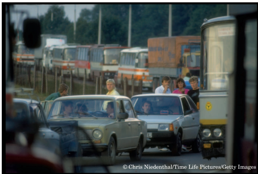
The chaotic scene on the Lithuanian-Polish border on 28 August 1991.

A colleague in Warsaw drove me on the four-hour trip through northeastern Poland to the Lithuanian border. Like most land borders in communist countries, the crossing in the otherwise sleepy Lithuanian town of Lazdijai was a chaotic mess. Long lines of cars and trucks inched their way to passport control booths, the first outposts of the stifling bureaucracy that was the Soviet system.