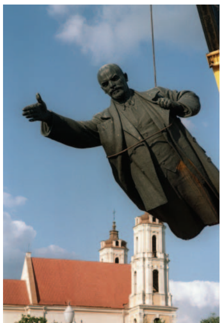
Lenin’s statue on its way out of Vilnius’ central square

The scene that day at the Seimas was different. The parliament building was ringed by Lithuanian troops and tanks. Every avenue from the city was blocked by checkpoints and steel tank barricades, and hundreds of sandbags were piled high around the build-