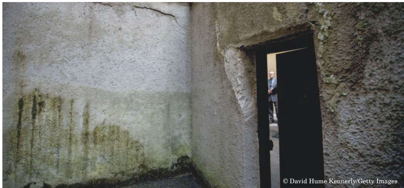
A cell in the Museum of Genocide Victims in Vilnius. VIPs visiting the city are often brought to the museum. Looking into this cell is Secretary of Defense Donald Rumsfeld on such a tour in October 2005.

The KGB headquarters is now the Museum of Genocide Victims, a reminder of man's inhumanity to man. The museum is the only one of its kind in the former Soviet Union. Some guides, like the committee chairman who led us through the dungeons, are former inmates. During the brief moment I spent in the cell, I felt certain that my career in CIA, dedicated to fighting the kind of brutality that took place in there, was not in vain. I was positive then that when I signed on in 1980, I had made the right decision.